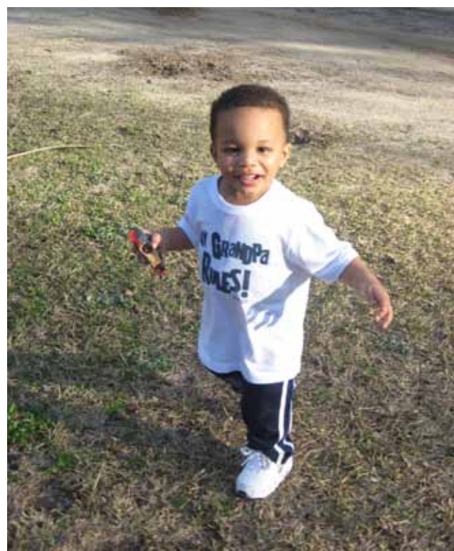
Figure 1. Play starts to become an important part of a toddler's life and can help them learn and develop motor skills.