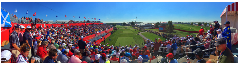
Panoramic view from first tee at Hazeltine during the Ryder Cup.