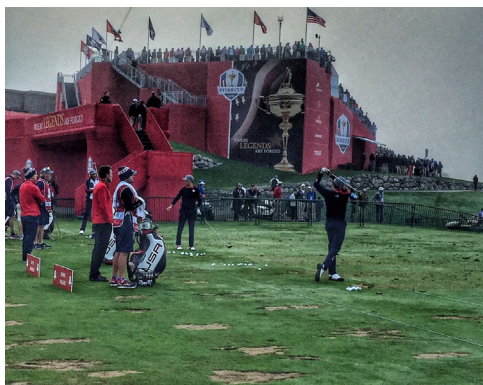
Players warm up behind the first tee grandstand on Friday morning of the Ryder Cup.