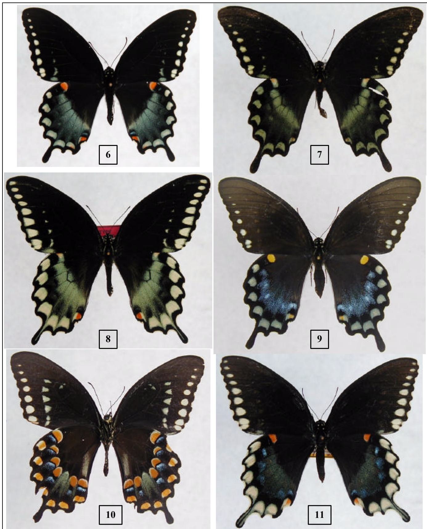
Fig. 6. Pterourus troilus ♂ ( ilioneus ): 7 Mar. 1991, old Hwy. 37, S. of Mulberry, Polk Co., FL. Fig. 7. P. troilus ♂ (green): 3 Aug. 2000, Brigham Landing., Burke Co., GA. Fig. 8. Holotype ♂ P. t. fakahatcheensis : data in text. Fig. 9. P. troilus ♀: 8 May 2000, Goose Creek, Berkeley Co., SC. Fig. 10. Paratype ♂ (ventral) P. t. fakahatcheensis : 27 March 1999, Collier Co., FL. (leg. Slotten). Fig. 11. Allotype ♀ P. t. fakahatcheensis : data in text. (All leg. R. Gatrell, except 10.) All figures X-1.