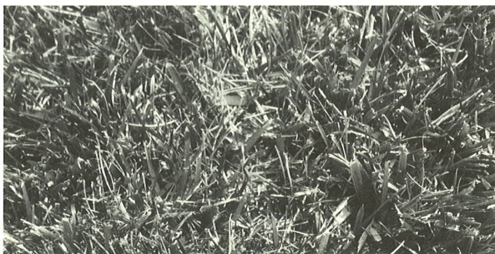
Figure 2. Declining rough bluegrass during summer surrounded by tall fescue that does not appear stressed.