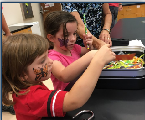
What better to do after butterfly face painting than to unlock some prizes in Escape!