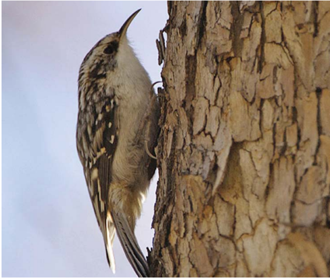
Brown creepers were among the bird species found to be more abundant in unlogged stands.

Hayes says that providing patches of unlogged forest within the matrix of salvage logging can mitigate for some of the impacts. “One of the things that this said to me is that retaining even fairly small patches as unsalvaged within salvage areas can make a big difference with regard to populations over time,” he says. When it comes down to specifics there is still more work to be done. How small can unlogged patches be and still mitigate effects on bird populations? How many trees should be left?