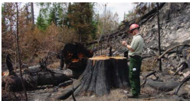
Fire-killed trees.