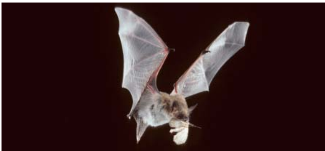
A yuma myotis, one of the bat species studied for this project, grabs dinner on the fly.

One of the few instances where the research did find a difference in response between salvage intensities had to do with the activity levels of bats. For analysis, Hayes used Anabat equipment and software to capture and evaluate the characteristics of recorded bat echolocation calls. They recorded in three of the twelve study stands at a time for seven consecutive nights twice each season, from 45 minutes before dusk to 45 minutes after dawn. In total they captured over 20,000 bat echolocation calls in 2005 and over 37,000 in 2006.