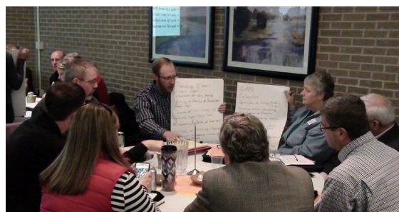
Each of the nine table groups listed and ranked top issues needing to be addressed to sustain and even increase Nebraska's success in beef production.