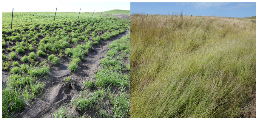
A May view of an OWB-infested roadside following a spring burn, showing erosion; and the same roadside in September illustrating the overwhelming elimination of other plants.

The seed sources of these beachheads for OWBs are seldom documented. It is generally speculated that it is from contaminated native grass seed coming from southern sources, from