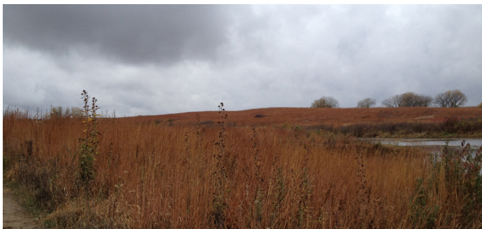
Early arrivers to the fall CGS Citizens Advisory Committee gathering got to "prairie peep" during the pre-meeting tour of Spring Creek Prairie.