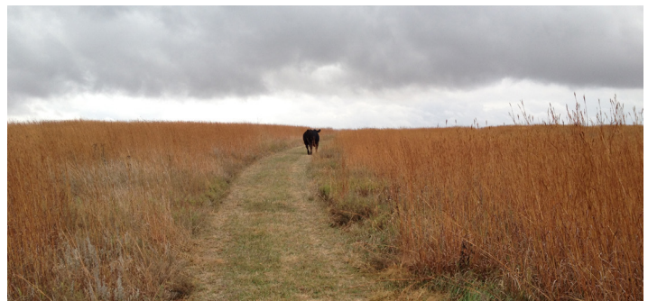
This critter that we encountered on our tour was more interested in eating the grasses at Spring Creek Prairie than enjoying their vibrant colors!