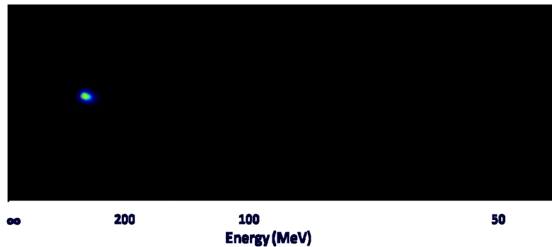
FIGURE 2. Monoenergetic, low-divergence beam, generated by 45 TW of laser power focused into a plasma with density of 7 \times 10^{18} \text{ cm}^{-3} . The energy is peaked around 320 MeV with a spread of 10%. The angular divergence of the beam (vertical axis) is 6 mrad.