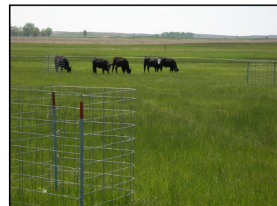
Figure 1. Steers grazing pastures on the subirrigated meadow at the Barta Brothers Ranch.

For the two grazing systems and four years of the study, estimates of forage intake were better predicted by the 2.3% of liveweight factor than the 2.7% of liveweight factor. Other research conducted by the University of Nebraska-Lincoln found that dry matter intake of cows and heifers was 2.23% of liveweight when the cattle were fed subirrigated meadow hay in confinement and at free choice. These results confirm that the AUD equivalent of 23 lbs DM/AUD used by Nebraska Extension is reasonably accurate.