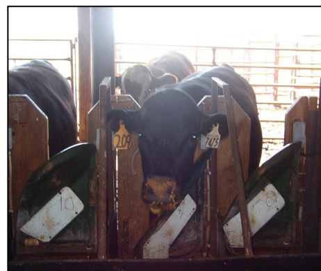
Pasture-grazed yearlings are gathered to receive individual supplements.

The RUP sources in these trials cost approximately $0.70 per lb of RUP. This means that the extra gain cost $1.32/lb. Determining if supplemental RUP is economical depends on the RUP sources available to producers. Distillers grains (DG) are a good source of RUP and are readily available in Nebraska. Assuming DG are 30-32% CP and 63% RUP, if purchased for $150/ton the DG would price into an operation between $0.35 to $0.40 per lb of RUP. This calculates to paying between $0.66 to $0.75 per lb of additional gain. The delivered price of DG is quite variable and is dependent on distance from ethanol plants and the ability to store and feed DG. The DG would also supply extra energy to the cattle that the RUP sources in these studies did not provide. This energy could boost ADG even more. A 10-year summary of calves grazing smooth brome grass and supplemented with DG had an ADG response of 0.67 lb per lb of RUP from DG. It is important to take into consideration the cost of the RUP supplement and the type of forage being grazed to determine if RUP supplementation is profitable.