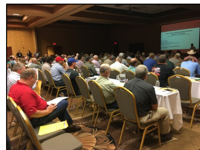
Diverse presentations offered something for everyone at the NGC.

"This is a consistently excellent program, and is the ONLY program that I absolutely attend yearly." - 2017 NGC Participant