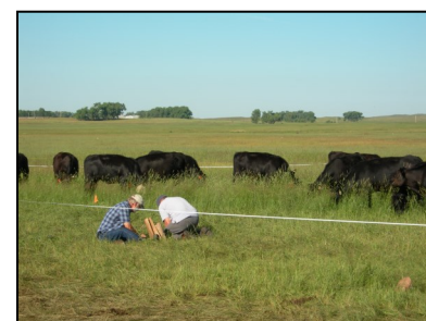
Figure 2. Clipping standing plant biomass immediately after grazing.

If you would prefer to receive an electronic copy of this newsletter instead of a print copy, please let us know by emailing mmckendree14@unl.edu . Thank you.