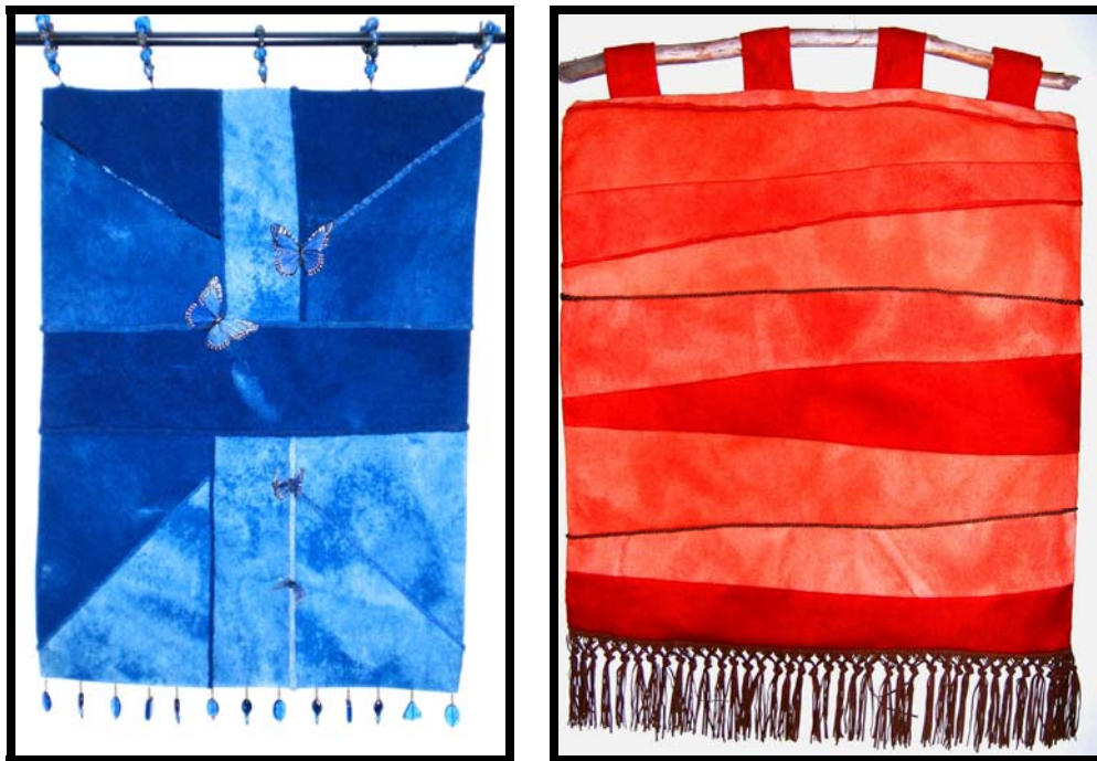
Figure 10 (left). Butterflies. Indigo dyed wool, glass beads, Size 30" x 25". Figure 11 (right). Red Earth. Madder root on wool, leather trim, Size 30" x 25".

For many years I lived in a sparsely populated valley in Norway, where I gave demonstrations in natural dyeing at exhibitions, cultural days and museums. Old people frequently came up to me and added information. I held courses, taught tapestry weaving, and made natural dyed products using different techniques, since many people have the limiting idea that the natural colors can only be used for weaving. I generally use silk and woolen fibers in yarn or fabrics to create my products.