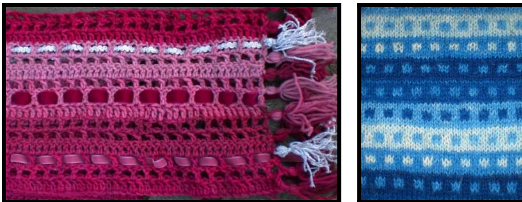
Figure 8 (left). Crochet scarf, korkje dyed wool. Figure 9 (right). Knitwear pattern, indigo on wool.

Even as a devoted textile professional, who has worked as a designer in Norway, Germany, Austria and Holland, I did not learn about natural dyeing until I lived in a remote valley in Austria. There I designed active wear (not naturally dyed) in the 1990's. Returning to Norway, I learned that we actually had a very rich dyeing tradition ourselves.