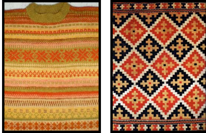
Figure 6 (left). Traditional pullover, wool dyed with St. John's wort and lichen Parmelia saxatilis . Figure 7 (right). Coverlet in traditional pattern, wool dyed with madder root and birch leaves.

Fashion and textile designers have for decades had a challenging job in Norway, with few exceptions. Norway has not delivered much fashion to the world either. The only item we may be known for is our knitted wool sweater in different traditional patterns. NICEF, Norwegian Initiative for Clean & Ethical Fashion, promoting environmentally friendly and ethical fashion made by Norwegian designers, was introduced at the Oslo Fashion Week in 2007. There is hope that some of the initiatives presented by NICEF, including the use of natural dye extracts, will be recognized one day.