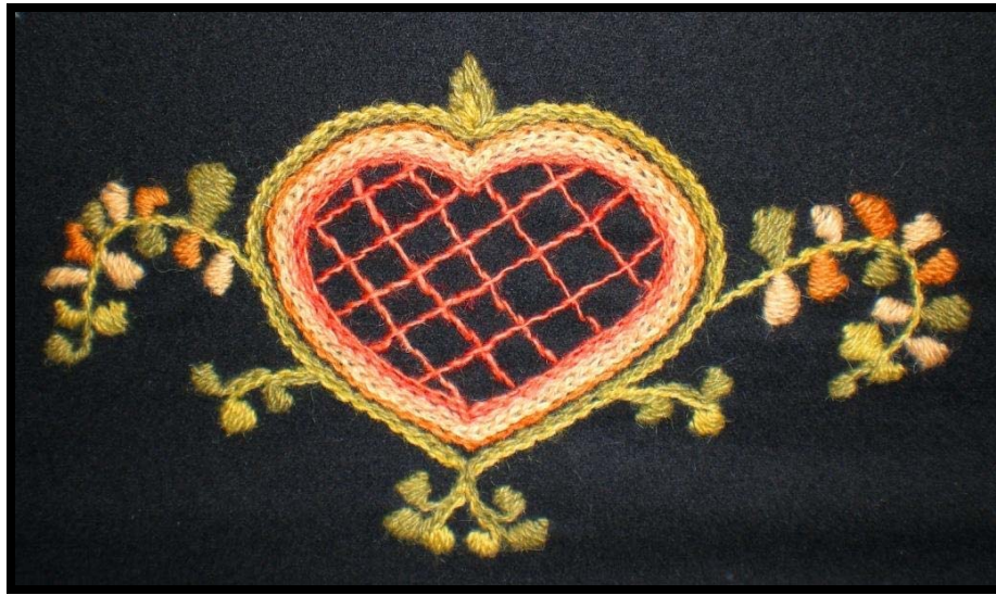
Figure 4. Traditional embroidery, wool on wool, dyes from madder, lichen Parmelia saxatilis, St. John's wort.

All textile work has always been considered woman's work in Norway, and the women would do the work at home. Norway didn't have the guilds which were common in the rest of Europe, at least not for what was considered women's work. And the guilds that existed came much later to Norway than to other European countries. For years, the few wealthy Norwegians would send their clothes to Europe to have them professionally dyed, or they bought dyed cloth abroad or from traders.