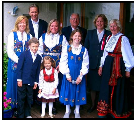
Figure 5. Norwegian folk costumes. Typical family photo, 3 different folk costumes representing 3 different regions in Norway; Vestfold, Gudbrandsdalen, Telemark.

In the 1970's, Norwegians voted not to become a member of the European Union and the folk costume was found again, and worn on special occasions.