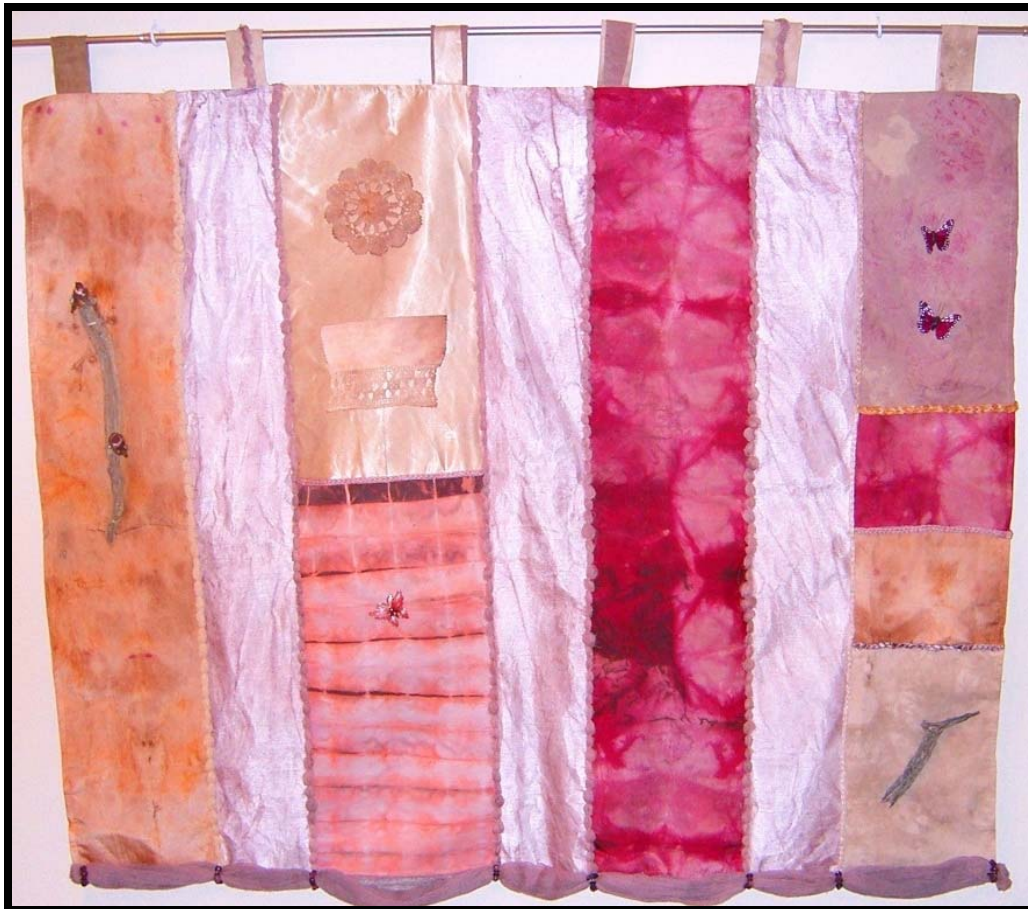
Figure 12. “Korkje stunt” (12) - a collage wall hanging, using the lichen Ochrolechia or “Korkje”. Fabrics are cotton, silk, wool, polyester, polyamide. Size 40” x 50”.

Karen has developed an adventurous and practical way to dye naturally using a zip lock bag instead of a pot. This means that we can do the dyeing everywhere and anytime and easily bring it with us, even on planes, as long as we take out the liquids. So, we were taught non-traditional ways of dyeing, using alternative mordants like sugar and window cleaner, and using zip lock plastic bags. Even if I already had my own methods for unpredictable dyeing, the zip lock method really opened up new doors for me when it comes to “stunt dyeing”.