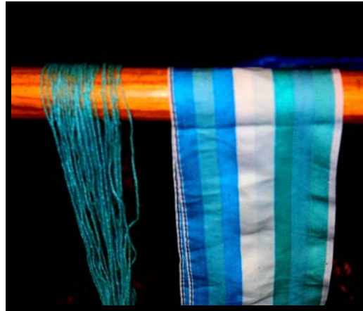
Figure 3. Woad grown in Norway (3). The color is more yellow than indigo. Photography by Emily Halvorsen, Norway 2007.

Trading with other people, imported dyes like indigo and cochineal were introduced, but this was not an immediate success. Norwegians loved their local blue dyes made from the woad plant, which gave a yellower blue than the indigo or lichen. For some time the daring risked being killed if they were discovered using the foreign indigo blue. The risk was probably taken as a matter of taste for the color, but the regulation was probably a way to protect the domestic woad production.