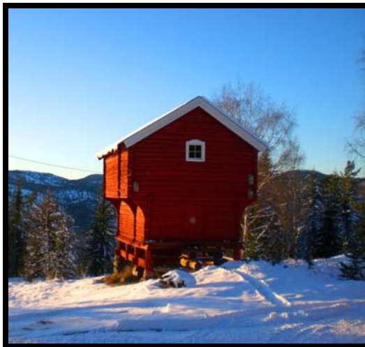
Figure 1 (left). Norway during summer time, Hardangervidda. Figure 2 (right). Winter time in Numedal. Typical pictures.

Despite the short summers, sources for all the rainbow colors can be found in nature. Plants, trees, bark, lichen, shrubs, mushrooms, seaweed and even purple snails ( Nucella lapillus ), are something the old Norsemen and women were aware of and used, not only on their home made textiles, but also as trading commodities. Sheep wool, linen, hemp and nettle were the most common fibers and from trading trips abroad (some would probably call these trips with different names) the Norwegians developed a taste for silk fabrics as well. The silk was, of course, used by the wealthiest only.