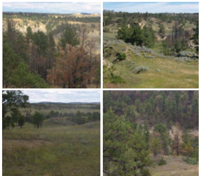
Photos documenting the variation in forest structure and burn severity throughout the study area; (top left) North Breaks prescribed fire and wildfire combined, (top right) South Breaks, (bottom left) HCross, and (bottom right) North Breaks prescribed fires.

But did it work? Did this ‘quick and efficient’ approach answer the original question: Did it make a difference in terms of management goals if the wildfire-burned land had been prescribed burned prior to the wildfire?