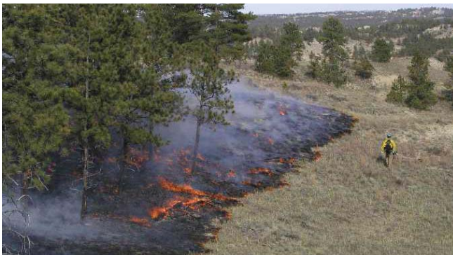
Test ignition for the HCross Prescribed Fire on April 22, 2003. Personnel working for the Yellowstone National Park Fire Use Module captured the image.

This is precisely what happened in the Missouri Breaks of eastern Montana when the Indian and Germaine lightning-sparked wildfires burned more than 100,000 acres. The two wildfires burned across areas which had previously been prescribed burned. But “pre-disturbance” data had not been collected before the outbreak of the wildfires.