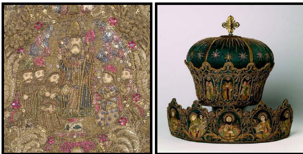
Figure 1 (left): Detail of mitre, 1779, Saint Gregory the Illuminator Blessing King Tiridates III and the royal family of Armenia following their conversion to Christianity.

The Church has a strong apostolic foundation which appears in its art. Saints Thaddeus and Bartholomew who were the first to bring Christianity to Armenia are found in textiles along with the remaining Apostles (Fig. 2). We have also documented them on a number of metal artifacts.