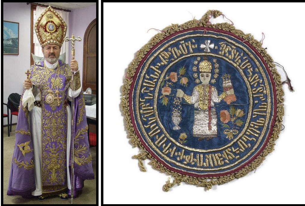
Figure 7 (left). His Grace Archbishop Aram Ateşyan in full vestment following the vesting ceremony.

deteriorated and reapplication onto new ground cloth for continued use. We documented numerous examples of this continuing practice (Fig. 8).