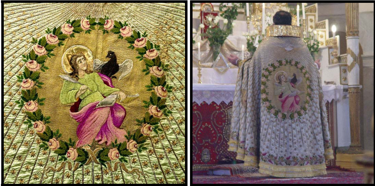
Figure 9 (left). Detail of Saint John the Evangelist on the back of an embroidered cope, 1877.

connected to Armenian Christian doctrine, the unity of the Christian community, and the Armenian people's unwavering attachment to the Divine mysteries of Christianity.