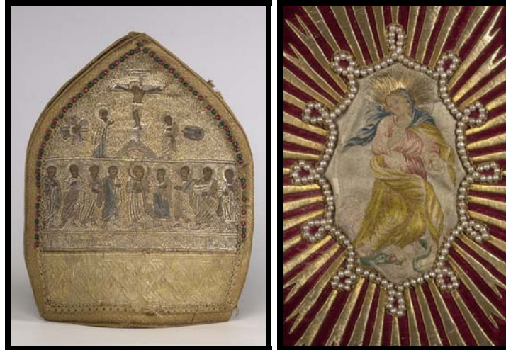
Figure 3 (left). Mitre, seventeenth century, with Byzantine influence. (Photo by Arman Ispiroğlu) Figure 4 (right). Detail of mitre, 1810, Mary as the second Eve embroidered in an 8 cm medallion. (Photo by Arman Ispiroğlu)

The unique expressions of Christian art worshippers observed during the Liturgy became authenticated as their own. While specific motifs were found in art attributed to the Ottoman period and the eighteenth and nineteenth century European art that influenced it, the Armenian examples were Christian in content and therefore viewed as Armenian.