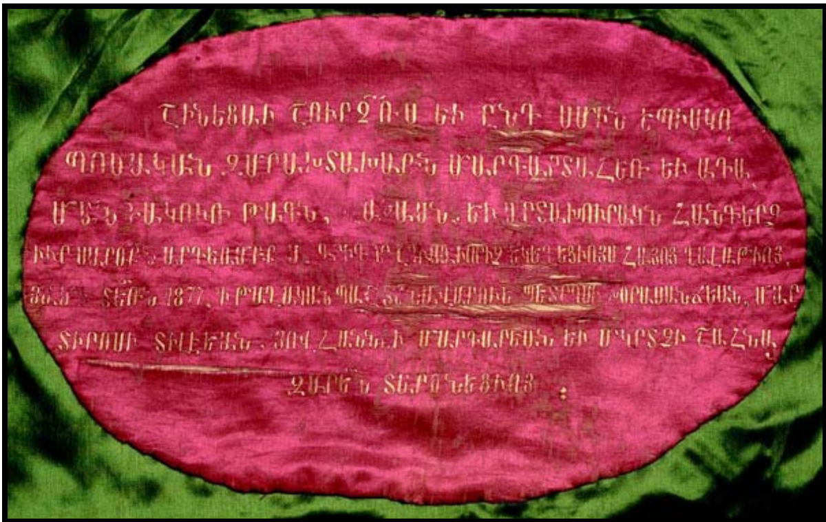
Figure 11. Embroidered inscription on the inside of the cope, 1877.