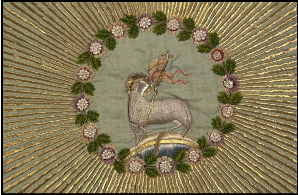
Figure 12. Detail of chalice cover, eighteenth century.