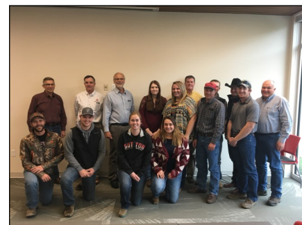
Attendees of the 2017 GLS Internship Symposium

The 2017 Internship Symposium presentations were videotaped and may be viewed by going to https://grassland.unl.edu/gls-internship .