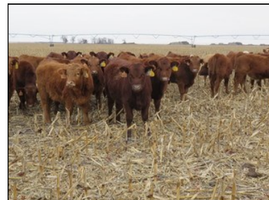
Cattle grazing corn residue.

The best evidence is provided by a sixteen-year study of corn residue grazing in eastern Nebraska. In this study grazing did not result in detrimental effects on soil properties (including bulk density and penetration resistance) or crop yields. These fields were silt-clay-loam soil and were managed under no-till in corn-soybean rotation. Grazing of corn residue improved soybean yields by 3.4 bu/ac with fall (November to February) grazing. An increase in the soil microbial community was observed (when compared to areas that were not grazed). The effects on the soil microbial community may explain the improvement in soybean yields because an increase in soil microbes (actinomycete bacteria and saprophytic fungi) may increase the rate of nutrient cycling. Another concern is that grazing may reduce soil OM (due to residue removal) or result in the export of nutrients such as N, P and K. After sixteen years of grazing, no differences in soil organic matter, N, P or K were measured. It is important to remember that most of the nutrients (such as N, P, K, Ca, etc.) consumed by cattle are excreted back on to the land.