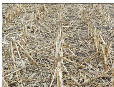
Difference in recommended grazing rates— grazed (right) and non-grazed (left).

Similar results have been observed in shorter term studies. In a western Nebraska field managed in continuous corn, grazing of corn residue for a five-year period did not affect corn yields (148 vs 154 bu/ac, for not grazed and grazed, respectively). A three-year study with five locations in eastern Nebraska also showed that grazing had no impact on subsequent crop yields. Three locations were managed under continuous corn with corn yields of 239 bu/ac for grazed and 223 bu/ac for ungrazed (which did not statistically differ). Two locations were in a corn-soybean rotation with soybean