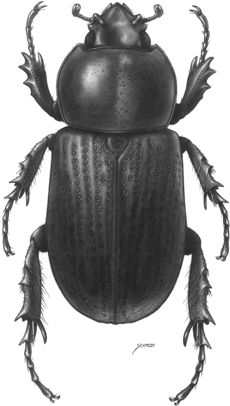
Fig. 1. Habitus of Hemiphileurus ryani Ratcliffe and Ivie, new species.