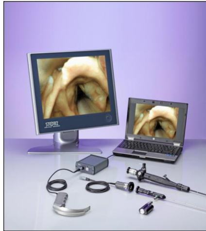
Figure 4. The Karl Storz C-Hub.

Figure 5 shows the C-HUB attached via a USB port to the TM64 telemedicine system. The videolaryngoscope (or other endoscopic instrument) can be attached to the C-HUB, allowing the image to be viewed on the computer screen and transmitted, allowing telemedical applications. The video laryngoscope camera is supported by the HIPPA compliant LifeSize® ClearSea™ desktop and mobile video conferencing software program ( LifeSize Communications , Austin, TX). In our previous work, we have used the Adobe Connect program to support the videolaryngoscope camera in a similar fashion [25-26].