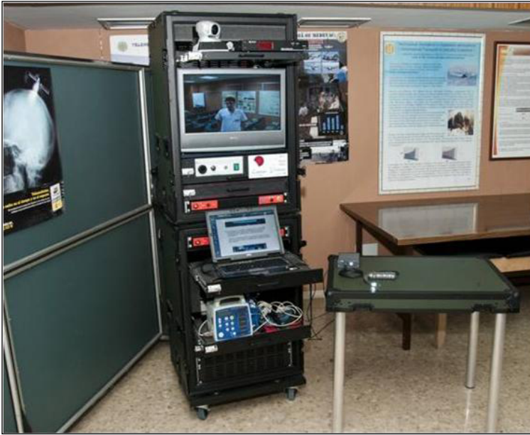
Figure 3. Photo of Spanish Military Telemedicine System in rugged box.

LEMO connectors are present to allow interface with various telemedicine devices. The TM64 serves as the link between medical personnel at remote, deployed locations and the reference hospital [24]. In using this device, it is possible to support: