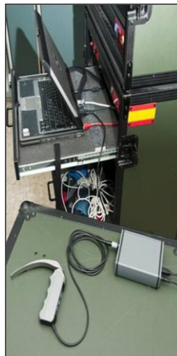
Figure 5. The Karl Storz C-HUB and C-MAC Videolaryngoscope connecting by USB to the telemedicine computer.

Figure 5 shows the C-HUB attached via a USB port to the TM64 telemedicine system. The videolaryngoscope (or other endoscopic instrument) can be attached to the C-HUB, allowing the image to be viewed on the computer screen and transmitted, allowing telemedical applications. The video laryngoscope camera is supported by the HIPPA compliant LifeSize® ClearSea™ desktop and mobile video conferencing software program ( LifeSize Communications , Austin, TX). In our previous work, we have used the Adobe Connect program to support the videolaryngoscope camera in a similar fashion [25-26].