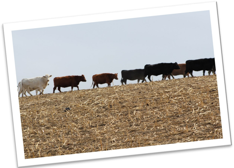
This interactive, online tool helps farmers and cattle producers connect and develop mutually beneficial agreements to use crop residue and forage cover crops for grazing.

UNL recommendations for establishing corn residue stocking rates are based on 50% utilization of leaves and husks (8 pounds per bushel or 20% of the total corn residue). Some additional corn residue disappears through trampling and wind loss, but we have not found increased erosion when only 40% to 50% of the corn residue is removed through grazing. Other factors such as fencing and water availability can be issues with corn residue grazing. Lack of access to cattle is another common reason that corn residue is not grazed.