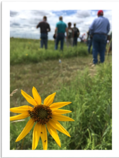
Stiff sunflower seen on the plant identification tour.

Approximately 84% of all conference survey respondents indicated that they were likely to very likely to make changes from knowledge gained at this conference. Survey respondents specified owning, managing, or influencing 1.4 million grazing lands acres with hay production and cropland grazing representing an additional 27,000 and 45,000 acres, respectively. Survey respondents also owned, managed, or influenced 42,019 beef cows, 1,300 bison, and over 4,000 small ruminants. Estimated knowledge gained from the 2019 Nebraska Grazing Conference would increase profitability $20.90 per head on an average herd size of 1,050 beef cows. While the total program value for the Nebraska Grazing would likely be greater, program value for 40 conference respondents who owned, managed, or influenced beef cows only was over $875,000. This speaks to the quality of the program and also to the future of managing the grassland resources in Nebraska and the Great Plains.