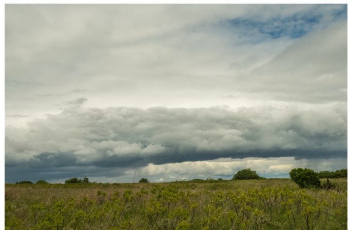
Nine-Mile Prairie landscape.

The Nine-Mile Prairie Advisory Council has been exploring opportunities to collaborate with the City of Lincoln's Prairie Corridor on Haines Branch project as well as obtaining formal integration of Nine-Mile Prairie into the planning and vision of the Lincoln and Lancaster County 2040 Comprehensive Plan. As part of these discussions, the importance of land use buffers surrounding Nine-Mile Prairie became an immediate priority to preserve for posterity the integrity of the Nine-Mile Prairie. The goal is to encourage and facilitate land management that is compatible with prairie conservation at Nine-Mile Prairie and sustainable grassland management in the surrounding public and privately-owned landscape through an extended management and utilization philosophy that creates a lasting land buffer. The development of a long range management plan for Nine-Mile Prairie and management strategies for its surrounding environs is essential for long-term prairie preservation and will honor Nebraska's prairie legacy while ensuring that all future generations have the opportunity to enjoy and learn from our native grasslands.