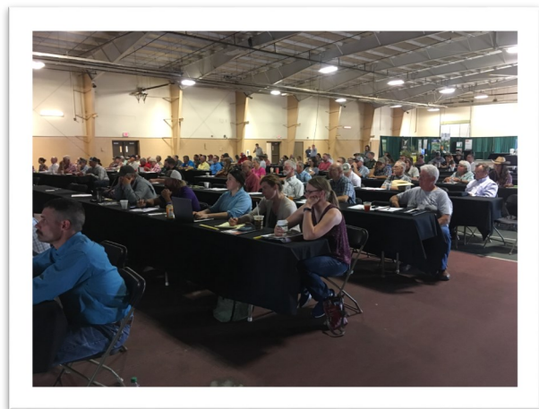
Participants listening to one of the 18 speaker presentations at the Nebraska Grazing Conference session.

The original goal for this year's Nebraska Grazing Conference was to build on enhancing traditional grazing lands management practices and provide insight for implementing practices that support the stewardship of grasslands and grazing lands resources throughout Nebraska and the Great Plains. This year's conference was a bit "different" than some of the past conferences due to the flooding that occurred in Kearney during early July. The only thing that remained rather constant was the program.