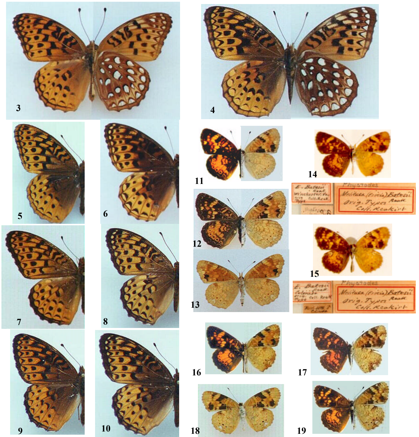
FIGS. 3-19. 3 , Topotype ♂ Speyeria aphrodite , 3 July 1983 Long Island, NY, dorsal and ventral surfaces. 4 , ♀ S. aphrodite , 3 July 1981 Ulster Co., NY, dorsal and ventral surfaces. 5 , ♂ S. cybele novascotiae , 28 July 1990, Halifax Co., N.S. Canada, dorsal surface. 6 , Topotype ♀ S. atlantis capitaneus , 1 July 1989, 8000', Lincoln Co., NM, dorsal surface. 7 , ♂ S. atlantis , 16 July 1983 Vilas Co., WI, dorsal surface. 8 , ♀ S. atlantis , 15 July 1983 Florence Co., WI, dorsal surface. 9 , ♂ S. atlantis ssp., 3 July 1987, 4200', Randolph Co., WV, dorsal surface. 10 , ♀ S. atlantis ssp., 28 June 1987, 4200', Randolph Co., WV, dorsal surface. 11 , ♂ holotype Phycoides batesii maconensis , dorsal and ventral surfaces, data in text. 12 , ♀ allotype Phycoides batesii maconensis , dorsal and ventral surfaces, data in text. 13 , ♀ paratype 077 P. b. maconensis , 10 June 1994 Macon Co., NC, ventral surface. 14 , VA ♂ syntype of P. batesii . 15 , CO ♂ syntype of P. batesii . 16 , ♂ paratype P. b. lakota , ex pupa 10 August 1994, Sowbelly Cyn., Sioux Co., NE. 17-18 , ♂♂ P. batesii . 19 , ♀ P. batesii . 17-19 , 10 June 1974 Jamesville, Onondaga Co., NY.