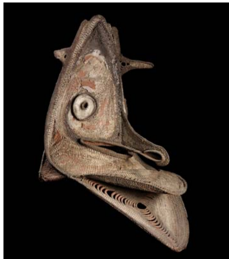
Figure 8. Female Mask, 20 th century East Sepik Province, middle Sepik River, between Karawari (Korewori) and Blackwater rivers, Kapriman village area, Kapriman language speakers. Jolika Collection of New Guinea Art, Fine Arts Museums of San Francisco, 2007.44.57.

A tradition of masterful basketry techniques are recorded in this region of the great Sepik River including coiling used to create very large gable masks for the front of men's ceremonial houses and these elaborate helmet masks. Bundles of split cane have been coiled to create the three-dimensional elements such as the lower jaw. This female mask in the Jolika Collection was collected with its male counterpart. They are a very rare pair. We don't have specific information about how the Jolika Collection masks were used in the village where they were created. However, there is documentation of similar masks from the same area used during initiation ceremonies when initiates received their scarification marks. 8