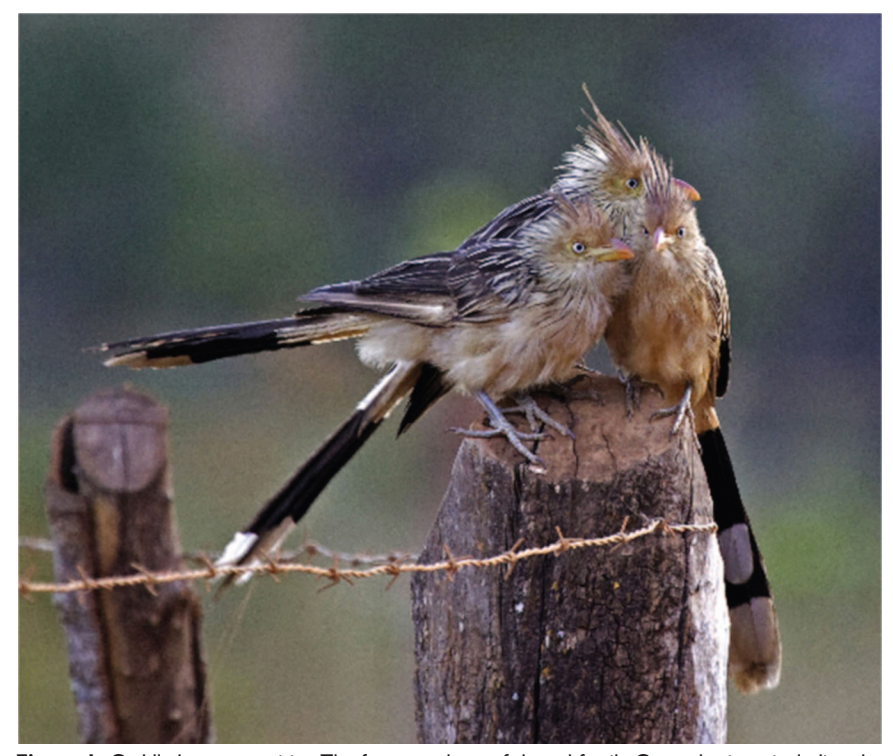
Figure 1. Cuddly but competitive. The four members of the subfamily Crotophaginae, including the guira cuckoo ( Guira guira ) shown here, are all communal breeders where several females lay eggs in the same nest and then cooperate to raise the offspring. However, competition is also rife and females toss each other's eggs to control the skew in maternity.

Riehl [10] conducted an experiment to test this idea, but the temporal change in egg color added an interesting twist to the standard egg addition experiment used to test for recognition. In an elegant two-factor design, Riehl added either fresh (white) or incubated (blue) foreign