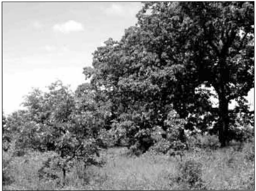
Figure 1. Oak cluster in Richard Bong State Recreation Area, restored by using fire, mowing, and herbicide methods. This site has an open canopy.

The size distribution maps show how larger individuals existed farther away from the oldest fence-line oaks in the more frequently managed site (Figure 2, upper panels) and the smaller oaks were closer to the fence-line oaks. In this site, the