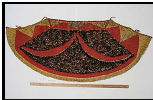
Figure 3. Joy Cape. The Bishop Museum, Honolulu, Hawai'i.