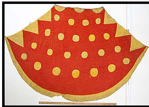
Figure 2. Joy Cloak. The Bishop Museum, Honolulu, Hawai'i.