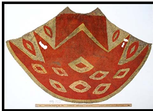
Figure 1. Chapman Cloak. The Bishop Museum, Honolulu, Hawai'i.

Sacred garments worn by the male members of the Hawaiian ali'i , or chiefs, these feather cloaks and capes serve today as one of the most iconic symbols of Hawaiian culture. During the summer of 2007 the Bishop Museum in Honolulu, Hawai'i, under the supervision of its conservator, Valerie Free, commenced a project to stabilize the cloaks so that they could be safely exhibited in the museum. This project was funded by a grant from the Institute of Museum and Library Services.