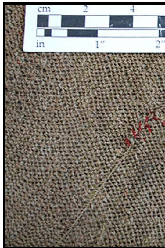
Figure 4. Chapman Cloak, olona netting. The Bishop Museum, Honolulu, Hawai'i.

The gauge of the netting varies from cloak to cloak, as well as from patch to patch. Differences in netting gauge can also be seen in feather color and design areas: larger feathers conceal more netting, allowing a larger gauge (and therefore less cordage) to be used. The Chapman cloak is thought to be the oldest in the collection, dating to the mid-18 th century, and it is also the most deteriorated. Believed to have been taken to Calcutta, India, in 1826, it was purchased for the Bishop Museum collection in 1937. Its voyages undoubtedly played a part in the poor condition