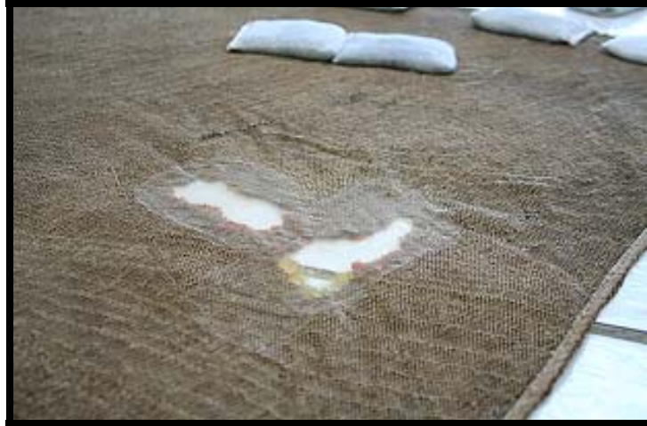
Figure 7. Chapman Cloak – sample of loss stabilization. The Bishop Museum, Honolulu, Hawai'i

The Chapman cloak has three large losses. No documentation of the cause of these losses exists, raising questions about how to conserve them for exhibition. They could originate from the use of the cloak as a battle garment, or they could have occurred at any point during its later life. The losses were not filled because it would not accurately represent the cloak's history, even though the damage cannot be interpreted to a specific moment in time. The losses had distortions around the edges that needed to be flattened before the tears could be repaired. The distortions were flattened with local humidification and pressure, and then repaired and stabilized in the same fashion as the other tears. 3 In addition, a double layer of the nylon mesh was sewn in place to prevent further stress at the edges of the loss. The brown mesh that was used to stabilize the area also seemed like a good compromise. It mutes the appearance of the black background of the mount, but does not hide the loss (Fig. 7).