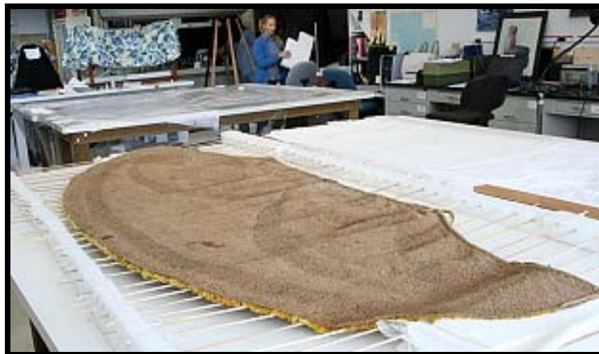
Figure 8. Joy Cape support. The Bishop Museum, Honolulu, Hawai'i.

The Chapman cloak has three large losses. No documentation of the cause of these losses exists, raising questions about how to conserve them for exhibition. They could originate from the use of the cloak as a battle garment, or they could have occurred at any point during its later life. The losses were not filled because it would not accurately represent the cloak's history, even though the damage cannot be interpreted to a specific moment in time. The losses had distortions around the edges that needed to be flattened before the tears could be repaired. The distortions were flattened with local humidification and pressure, and then repaired and stabilized in the same fashion as the other tears. 3 In addition, a double layer of the nylon mesh was sewn in place to prevent further stress at the edges of the loss. The brown mesh that was used to stabilize the area also seemed like a good compromise. It mutes the appearance of the black background of the mount, but does not hide the loss (Fig. 7).