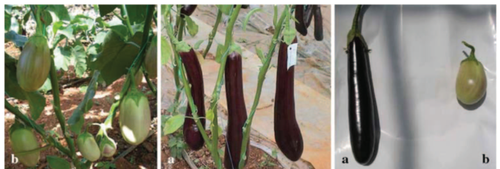
Figure 1. Plant and fruit architectures of fusarium wilt susceptible 'NSFB99' (a) and resistant 'LS2436' (b) eggplant ( Solanum melongena L.) genotypes

Phenotyping of the segregating populations for reaction to FOM was carried out in a climate-controlled greenhouse in BATEM, Antalya, Turkey. The seeds of the parents, F 1 , F 2 and BC 1 populations were first sown in sterile planting medium where healthy seedlings were produced and maintained until inoculation. The exper-