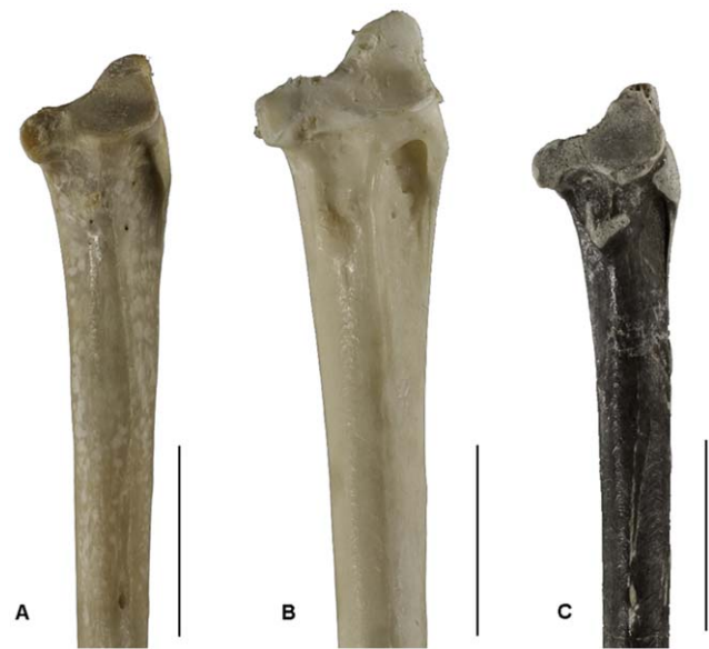
Figure 2. Comparison of the anterior view of the proximal end of the ulna. A, Gypohierax . B, Necrosyrtes . C, Anchigyps voorhiesi gen. et sp. nov., holotype (UNSM 62877). Scale bars equal 2 cm. doi:10.1371/journal.pone.0048842.g002

The left tibiotarsus (Fig. 1E–H) is nearly complete preserved except the proximal end. Crista cnemialis cranialis is relatively long, with its distal end reaching the proximal end of the crista fibularis (Fig. 1E), a feature of most non-vulturine accipitrids. Unlike modern large sized accipitrids, such as Aquila , the distal part of the crest is much lower and the proximal part directs outward in Anchigyps voorhiesi . The crest nearly parallels the shaft in extant Old World vultures, but only the distal part of the crest does so in Anchigyps voorhiesi . The crista cnemialis lateralis is as long as the cranial crest, although lower. Sulcus intercnemialis is narrow and shallow, judging from the direction and the morphology of the crests. Facies gastrocnemialis is relatively broad. Crista fibularis is long, blade-like, and more protrudent distally than proximally. The shaft of the tibiotarsus is straight, robust and nearly circular in cross section at the mid-point; this characteristic can be observed in most Old World vultures, but is absent in non-vulturine