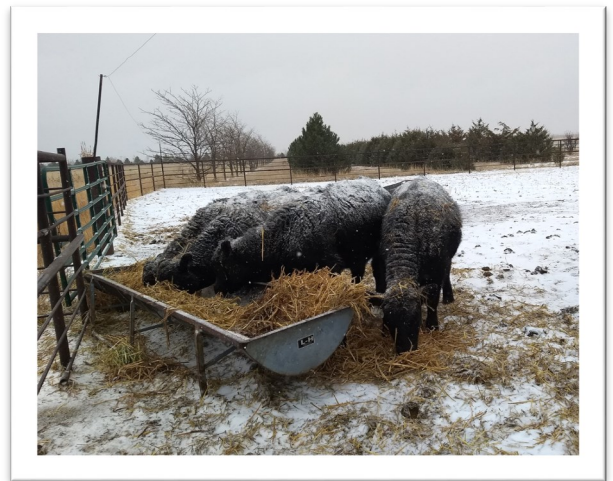
Taking steps to improve body condition score before cold weather hits can help reduce the impacts of cold weather on the cows.

It is also important to understand that a wet hair coat is a completely different ball game. A wet coat increases the LCT of a cow in good condition to 53°F. Thus, essentially anytime a cow's coat is wet in the winter they will be using energy to maintain body temperature. Therefore, in winters with more precipitation, especially freezing rain, we often see greater decreases in BCS.