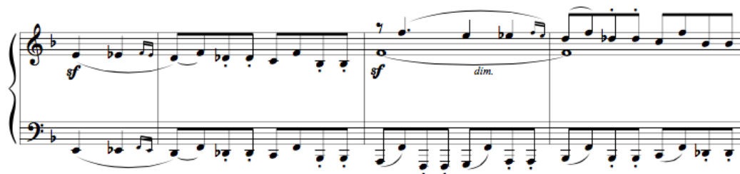
Figure 40. Similar articulation to the sixth-movement badinerie. Sonata No. 6, VII. Allegro con fuoco , mm. 74-77

A motif in the closing thematic area consists of a two-note slur followed by two staccato notes, which was established in the previous badinerie movement (Figure 36). Other related motives exist between movements, such as the primary themes of the second and seventh movement, but it is difficult to determine if they are derivative of each other. However, the overall character of this movement and the second movement binds the sonata together with two large and well-developed sonata forms.