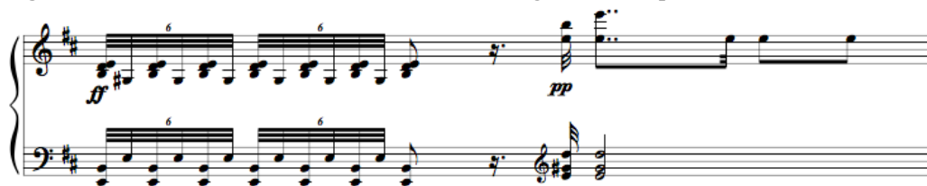
Figure 52. Drumroll motif, Sonata No. 9, III. Adagio molto espressivo , m. 21 and mm. 28-29