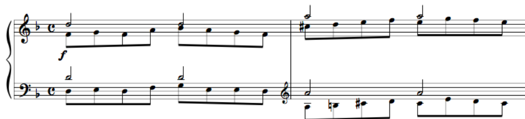
Figure 35. Example of early Baroque/late Renaissance variation style. Bull, Walsingham, Variation No. 15, mm. 1-2