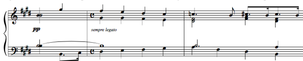
Figure 23. Melodic emphasis. Sonata No. 5, I. Allegro molto moderato ed espressivo , mm. 0-2

The melodic style and contrapuntal emphasis of the first movement recalls the aesthetic of the first sonata. This ternary form possesses rondo qualities due to the nesting of a ternary form within the A section. The ternary/rondo ambiguity is shared with the second movement of Sonata No. 3. Additional similarities of melodic treatment between these two movements show a continuing development of the primary melodic motif. Rather than adding textural layers as in Sonata No. 3, Czerny changes accompaniment altogether, effectively recomposing every statement of ‘a’ theme.