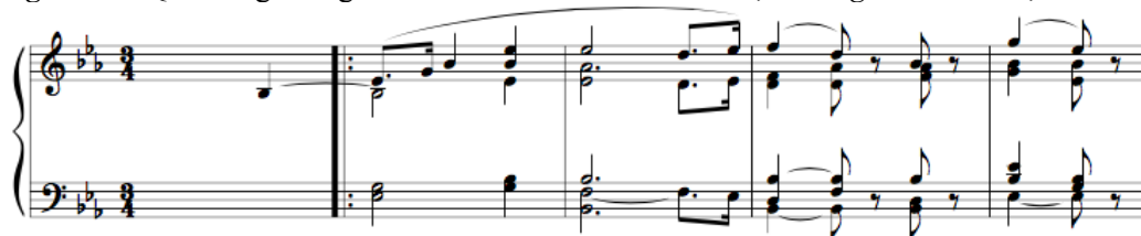
Figure 44. Quiet beginning to Collection III. Sonata No. 8, I. Allegro moderato , mm. 0-4

This movement, in contrast to Sonata No. 7, gives prominence to the melody, continuing the melodic/motivic pattern. The sonatas emphasizing melody tend to introduce a new theme during the development in an effort to extend the section. Czerny opts not to include a new theme in this development, which results in a section consisting of only thirty measures.