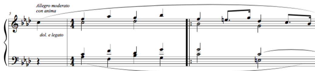
Figure 19. Similar opening theme to the first movement of Sonata No. 1. Sonata No. 3, I. Allegro moderato con anima , mm. 0-2