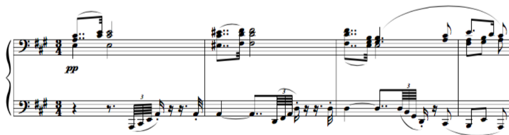
Figure 59. Similarities with the third movements of Sonata Nos. 1 and 9. Sonata No. 11, II. Adagio con espressione , mm. 1-4

incorporate a patchwork progression of thematic areas. The additional comparisons with Sonata No. 1 add to the symmetrical closure provided by this sonata.