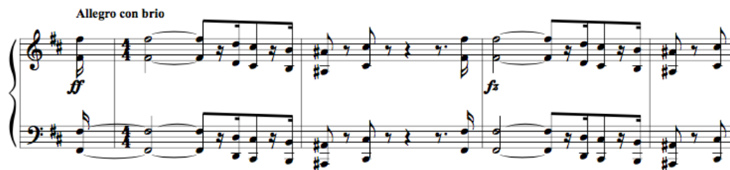
Figure 48. Opening motif. Sonata No. 9, I. Allegro con brio , mm. 0-4