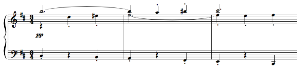
Figure 33. Similar aesthetic to the scherzo of Sonata No. 5. Sonata No. 6, IV. Presto scherzo , mm. 1-3

This scherzo works in conjunction with the second scherzo (sixth movement) to frame the slow fifth movement. This compositional technique is utilized identically in Sonata Nos. 8 and 9, the other sonatas with two scherzi. The framing of a movement with scherzi is a common practice within this sonata cycle, offering further affirmation of the overarching structure.