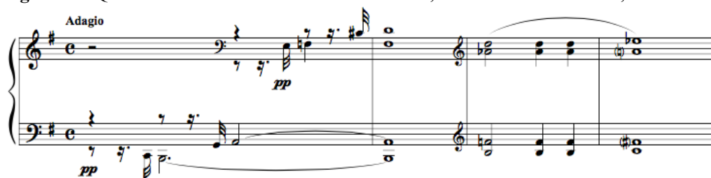
Figure 37. Quote from first movement. Sonata No. 6, VI. Presto scherzando , mm. 165-168