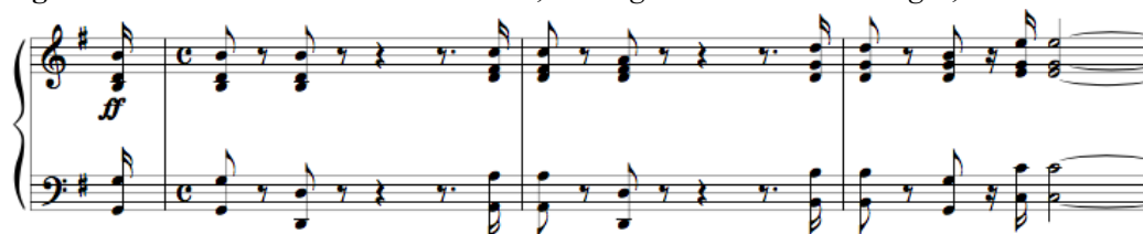
Figure 21. Thinner texture. Sonata No. 4, I. Allegro vivace e con energia , mm. 0-3

The first movement returns to the thinner textures and motivic emphasis observed in Sonata No. 2. The structure of the movement is in sonata form and features two themes in the secondary area, similar to the first movement of Sonata No. 3. In this movement, Czerny places a greater emphasis on transition sections than in his other sonata-form movements. The second secondary theme functions as a transitory passage to the closing theme because of its harmonic instability. Besides displaying Czerny's proclivity for long transition sections, this sonata also displays his inclination toward harmonic movement in thirds. Typically, Czerny saves his mediant harmonic shifts for transition or development