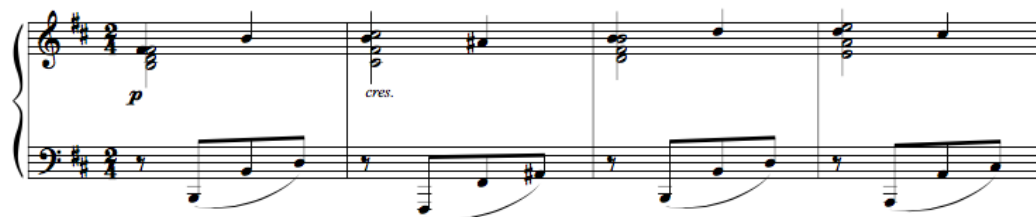
Figure 53. Strong-beat dissonance, weak-beat resolution. Sonata No. 9, IV. Allegro vivace , mm. 1-4