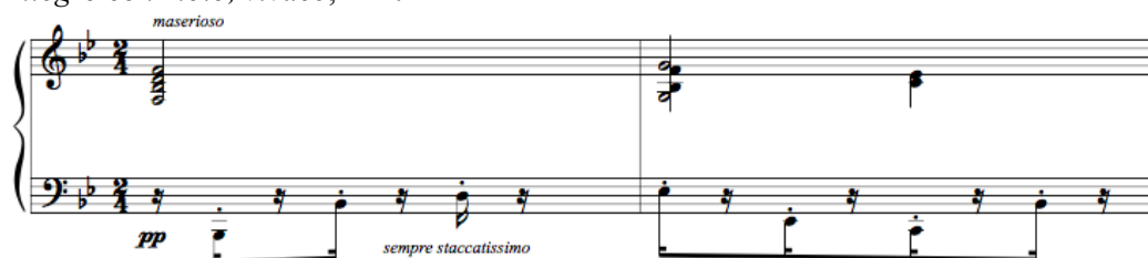
Figure 32. Pizzicato bass line, similar to the second movement of Sonata No. 2. Sonata No. 6, III. Allegro con moto, vivace , mm. 1-2

Symmetry is again apparent in this rondo movement, although more subtly. The C section ends with a brief statement of B, which retransitions back to A. When observed within the context of the thematic structure, the brief statement of B advances the movement, ABACBAB, reversing the second half. On a larger scale, this type of reversed symmetry is present in the relation of harmonic movement between Collections I and III.