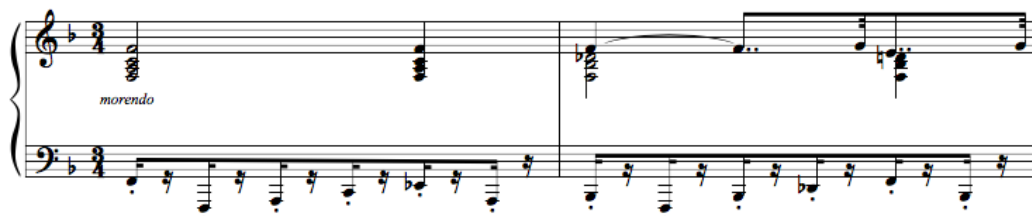
Figure 16. Pizzicato bass. Sonata No. 2, II. Adagio sostenuto , mm. 60-61

Czerny's ternary preference. This movement's ternary form includes a short coda and an interesting B section that ends on an A dominant chord which unexpectedly resolves to F major, and then reprises the A section. The thematic areas of this movement showcase Czerny's use of sharp contrasts in musical material and texture to offset the A and B sections. The coda of this movement differs from both previous sections, and includes a pizzicato bass line, which exhibits Czerny's creativity and inventive articulation. The pizzicato bass texture is revisited in the third movement of Sonata No. 6, which raises the question: is this moment of Sonata No. 2 foreshadowing the upcoming sonata?