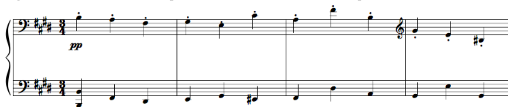
Figure 24. Unsettled counterpoint. Sonata No. 5, III. Scherzo presto , mm. 1-4

The third movement is the middle movement of the sonata and is the only movement to break away from the long, flowing melodic emphasis. The structure of this sonata, with its highly contrasting middle movement, is reflected in the construction of Czerny's ternary forms, particularly the scherzo movements with their trio sections.