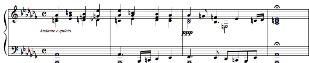
Figure 13. Quote from first movement. Sonata No. 1, V. Capriccio fugato , mm. 115-118

The last four measures of this movement recall the opening theme from the first movement, adding another degree of thematic unification to the sonata. Not only is the fugue based on a theme from the fourth movement, but the opening theme of the first movement is voiced over the final statement of the subject, effectively ending the whole sonata where it began.