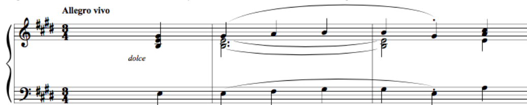
Figure 42. Different scherzo style. Sonata No. 7, III. Allegro vivo , mm. 0-2

This scherzo and trio share the same harmonic relationship as the scherzo and trio from Sonata No. 5, mirroring the connection between the scherzi of the first and last sonata. Czerny not only relies upon his scherzi for rhythmic and melodic vitality, but also for moments of symmetric harmonic structure.