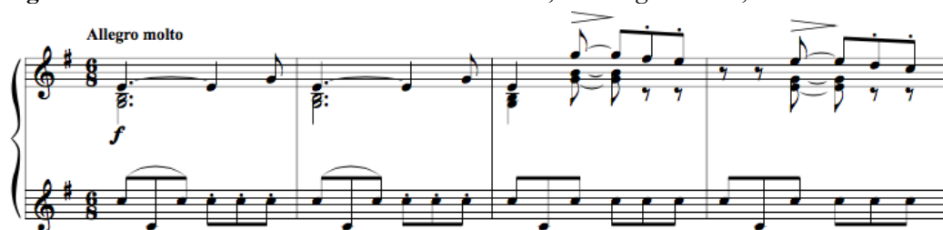
Figure 43. Dramatic fifth movement. Sonata No. 7, V. Allegro molto , mm. 1-4

incites the excitement in this movement; the composer focuses on dissonant intervals such as minor seconds and a perpetual triplet feel. The last movement is the broadest of the sonata and contrasts greatly with the other movements. This sonata is one of three that ends with an expansive and dramatic sonata-form movement; the others are Sonata Nos. 3 and 6.