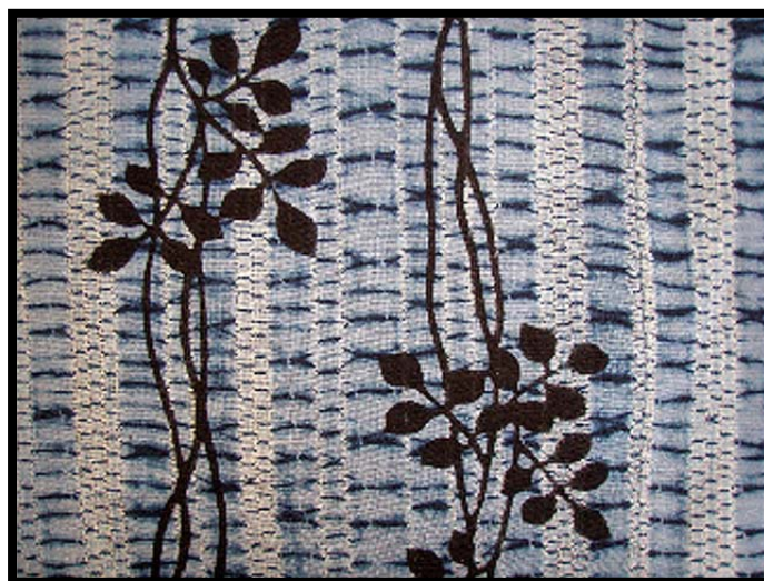
Figure 2. Taiten shibori with stencil print, 1930's – 1960's, author's collection.

So the weaving was completely separate from the dyeing, true to the strict division of labor that has always existed in shibori production. There was room for creativity in the weaving only in the placement of the gathering threads and an occasional small stripe in the warp.