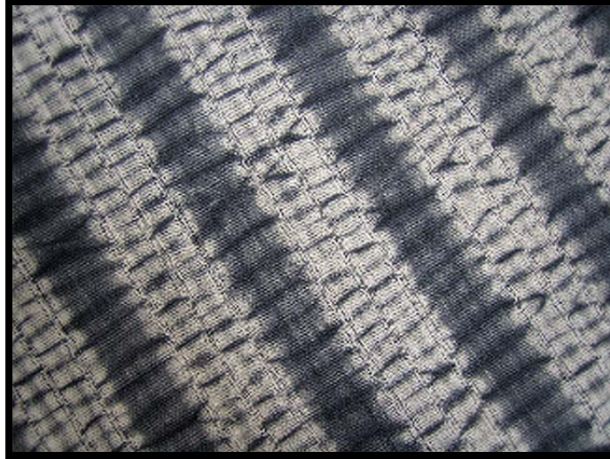
Figure 1. Taiten shibori , 1930's – 1960's, author's collection.

Historically, the fabric was woven as a balanced plain weave, using fine cottons for both warp and weft. The sett of the warp ranged from approximately 56 to 64 ends per inch. The finest piece I have analyzed was made with a singles cotton (approx. a 40/1) in both warp and weft and a sett of 64 ends per inch. Heavier, very tightly twisted, and possibly waxed warp threads were inserted at intervals ranging between 14 and 50 warp threads. The variation in the space between these gathering threads altered the resultant dyed pattern. When threads were spaced close together, the resist was greater, preserving more of the original white cotton. When they were further apart, the resist was less, allowing more dye to penetrate the cloth. Rhythmic patterns were formed by changing the distance between the gathering threads in a single piece of cloth.