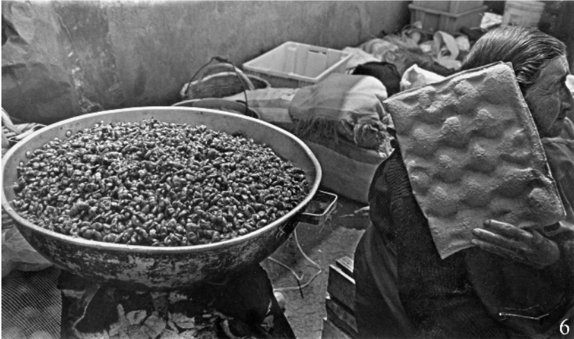
Figs. 5-6. (5): Scarab larvae, probably Megasoma actaeon (L.) (Dynastinae), collected near Manaus, Brazil. (6): Platycoelia lutescens being sold for food in a market in Quito, Ecuador, 1999.

larvae constitute a managed resource. Although beetle larvae are preferred over adults, the Tukanoans favored the adults of Megaceras crassum Prell (Dynastinae), a large (ca. 40 mm) scarab, more than larvae. Dufour noted that some insects (including scarabs) were less predictable in space and time and so were collected opportunistically in small quantities (Fig. 5). Other insect foods, like palm weevil larvae, termites ( Syntermes sp.), and leaf cutter ants ( Atta sp.), were sought after and collected in larger quantities.