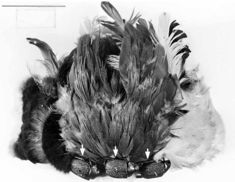
Fig. 7. Jivaro headdress incorporating three entire Chrysophora chysochlora adults (arrows) on the headband. Each beetle is approximately 30 mm long.

northwest Amazon, they increased the supply of grubs by felling or notching the trees to provide breeding sites for the passalids (Metraux and Baldus 1963).