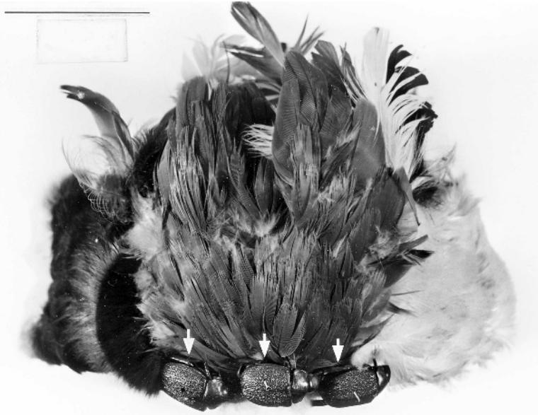
Fig. 7. Jivaro headdress incorporating three entire Chrysophora chysochlora adults (arrows) on the headband. Each beetle is approximately 30 mm long.

northwest Amazon, they increased the supply of grubs by felling or notching the trees to provide breeding sites for the passalids (Metraux and Baldus 1963).