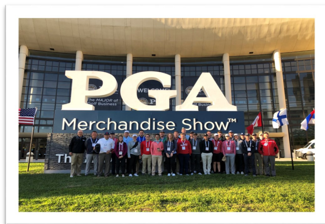
PGA Golf Management students and faculty at the 2020 PGA Merchandise Show in Orlando, FL.

Students engaged in interactions with numerous vendors learning about the latest and greatest in the golf industry from club manufacturers, technology companies, clothing/apparel companies, travel companies, and others. Many students interviewed with the countless PGA professionals looking to secure interns or full-time employees for the coming season and several walked away with multiple job offers in-hand.