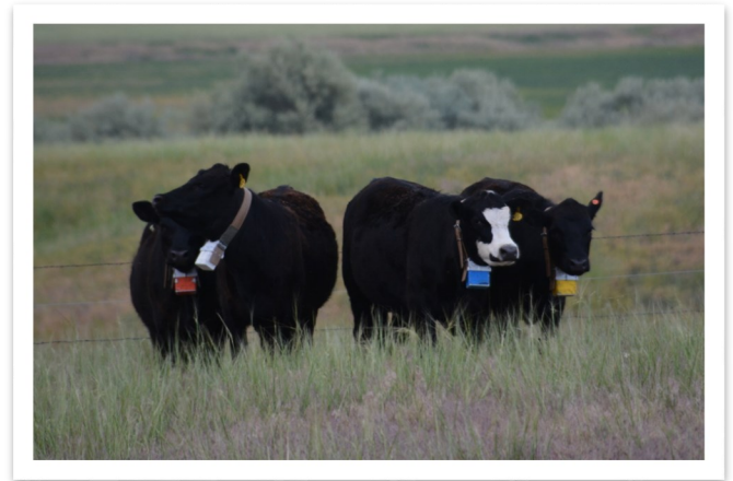
Figure 2. Cattle fitted with GPS collars in a study evaluating how cattle utilize the invasive annual grass cheatgrass ( Bromus tectorum ) in western Nebraska. With GPS-tracking, we can measure the amount of time cattle select to graze in cheatgrass compared to native perennial grass patches early in the growing season.

Raising livestock on rangelands is strongly tied to tradition and the value of a knowledgeable practitioner will never be replaced by Precision Ag technology. However, technology can provide valuable tools to assist rangeland managers with better understanding of plant and animal interaction dynamics, thus enhancing the opportunities for improved ecosystem services across rangeland landscapes.