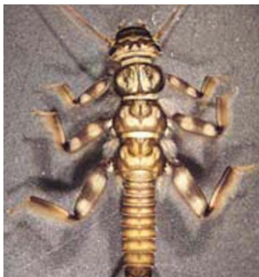
Samples of macroinvertebrates such as this stone fly ( Claassenia sabulosa xerces ) were collected at untreated control sites.

Macroinvertebrates: Big enough to be seen with the naked eye, macroinvertebrates are a fundamental part of the freshwater food web, helping break down organic matter such as algae and leaves as well as becoming food for birds and fish. Small but significant, macroinvertebrates are valuable indicators of watershed condition, providing information about stream productivity, water quality, and stress levels. As a result, researchers observed the direct and indirect effects of prescribed fire on macroinvertebrate species composition, richness, diversity and abundance.