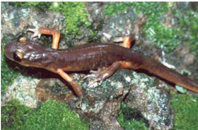
Amphibians such as this Ensatina salamander need cool clean water, shade, and dead woody debris to survive.

Amphibians: Cool temperatures and moist conditions created by perennial and intermittent stream microclimates are necessary for the survival of amphibians found in the study region. In fact, it appears that amphibians may be particularly sensitive to treatment-related disturbance. Using a literature review, researchers evaluated the potential effects of unbuffered fuel treatments on a variety of amphibian species, including Ensatina, Pacific Giant Salamander, and Siskiyou Mountain Salamander, which were confirmed present during preliminary surveys of the study basins.