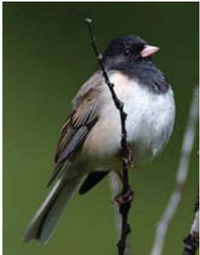
This ground nesting Oregon Junco is just one of the many bird species that use riparian habitats.

For macroinvertebrate assemblages, little to no adverse effects were measured in both buffered and unbuffered areas.