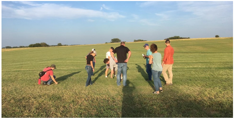
A fall trip to Stock Seed farms in Murdock, NE, organized by the Range Club, drew interest from both GLS and GECM students.

Grazing Livestock Systems, the first major offered through the Center for Grassland Studies, is getting a facelift starting in Fall 2021! This facelift will take the two grassland-focused majors that CASNR offers, Grassland Ecology and Management (GECM) and Grazing Livestock Systems (GRLS), and move them under the umbrella of a single major: Grassland Systems (GRAS). Before anyone panics, be assured that the majors themselves aren't undergoing changes - they are just becoming options under the Grassland Systems major. What are these two undergraduate programs and why bother with this change you ask?