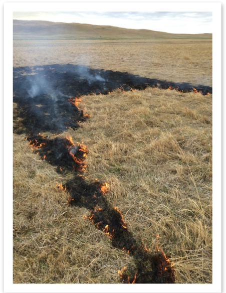
A research plot being burned in early-May to investigate the effects of burning on subirrigated meadows.