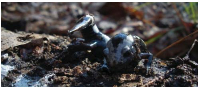
The marbled salamander ( Ambystoma opacum ) breeds in fall in temporary ponds downslope from longleaf pine stands.

Worldwide, the herpetofauna are in decline. Amphibians, which include salamanders, frogs and toads, and the legless caecilians, are at particular risk, with an estimated one third of the total species at risk of extinction. Amphibians are exquisitely sensitive to environmental insults, in part because most have skin that is permeable to water and air, and also because many have a biphasic life cycle; that is, they spend part of their life as aquatic residents and part of their life as terrestrial denizens.