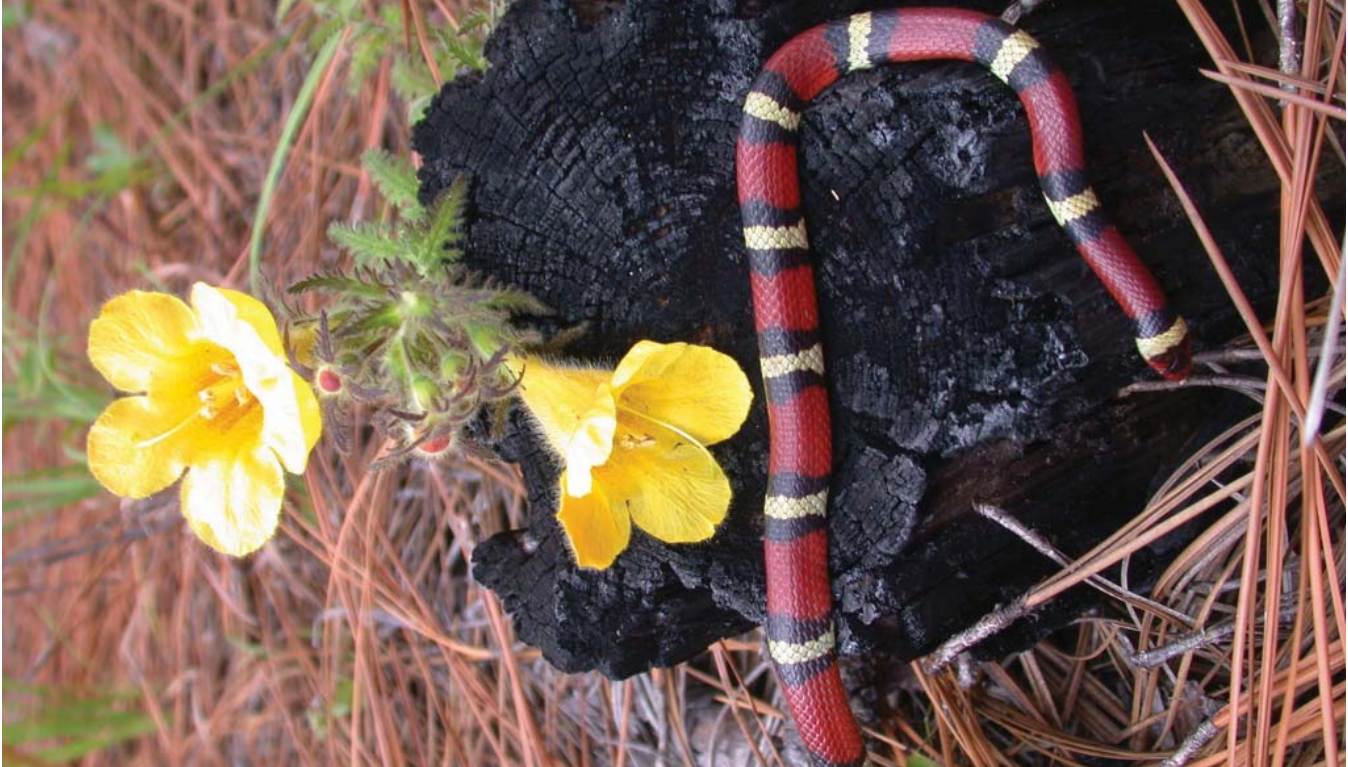
A scarlet snake ( Cemophora coccinea) makes its way through a recently burned longleaf stand in the Oakmulgee District.