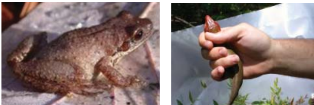
(Left) The Mountain Chorus Frog ( Pseudacris brachyphona) is one of several species in the Oakmulgee District not commonly associated with longleaf pine forests elsewhere in the East. (Right) Skinks such as this broadhead skink (the largest skink in the southeast), are abundant residents of longleaf pine stands in the Oakmulgee District.

Each specimen was sexed, aged, weighed, and measured from snout to vent—the cloaca, which in herps is the end of the intestinal excretory and reproductive tracts—and length of tail. The animals were then toe-clipped to obtain tissue for later genetic analyses and released. For snakes, a piece of ventricular scute, one of the small scales on a snake’s belly, was excised. If a marked specimen was found in further collections, it was excluded so that all analyses were based on real numbers, not recaptures. Specimens of tissue are being housed at the University of Alabama Herpetological Collection at the University of Alabama as part of a long-term effort to document the genetic diversity of herps in this unique physiographic zone. So far, more than 15 amphibian species and nearly 30 reptilian species have been identified, many of them quite common, such as the Spring Peeper often heard in vernal ponds and the Garter Snake, found in many suburban yards.