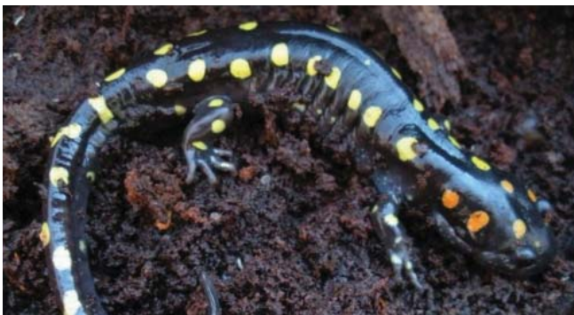
Spotted Salamanders ( Ambystoma maculatum ) live in forested uplands for most of the year yet migrate to isolated wetlands for breeding each spring.