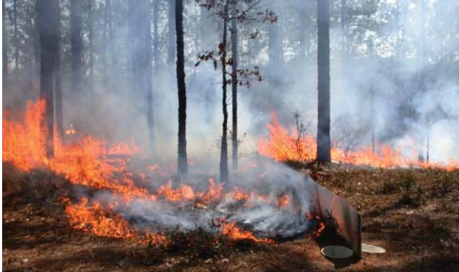
A prescribed burn overtakes a drift-fence at a study stand in the Oakmulgee District.

treefrogs, special traps similar to natural shelters were constructed of PVC pipe. Technicians also fanned out to look for specimens that were not on the move, but rather resting or burrowing under logs, stones, or leaf litter. Between January 2006 and July 2008, samples were collected for 14 days in a row, followed by 7 days of no sampling.