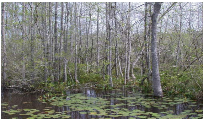
The Oakmulgee District is a kaleidoscope of habitat types. These imposing black tupelo swamps lie scattered within a diverse matrix of longleaf pine and mixed hardwood forests.

In the tropics, disease has taken a harsh toll on amphibians. In the United States, the situation is less dire, but the presence of a fungal pathogen ( Batrachochytrium dendrobatidis ) in several states could prove deadly for many species. For now, California and Alabama are still rich in amphibian species. "Alabama is the number one hot spot in the country for amphibians," says Rissler. California and Alabama also lead the country in extinctions of amphibians. In California, the threats include habitat loss from development and expansion of invasive species. In Alabama, threats include hydroelectric projects, coal mining, and pollution that compromise the integrity of aquatic systems. For the herps that inhabit the rare, fire-dependent upland longleaf pine ecosystem, the absence of fire and expansion of hardwood forest are also threats.