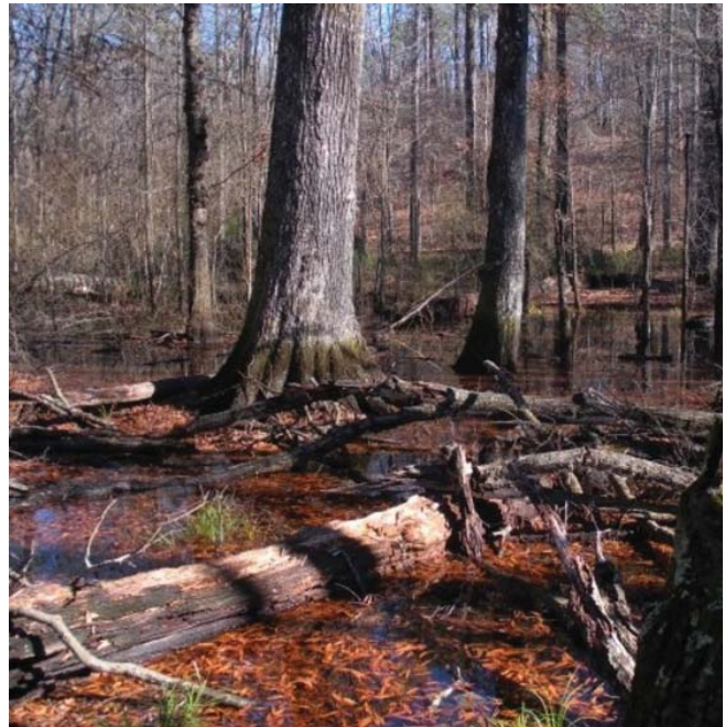
Vernal ponds provide essential breeding habitat for amphibian species that spend most of the year in forested uplands.