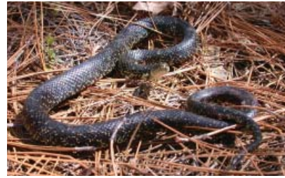
The Black Kingsnake ( Lampropeltis getula nigra ) is a subspecies found at the southernmost extent of its range in the Oakmulgee District. Credit: Jimmy and Sierra Stiles, University of Alabama.

and evenness. Species richness is the number of species within a stand. Species evenness is a measure of the relative number of species; for example, if five individuals are found in one sampling, with four individuals of one species and only one individual of another, the sample is uneven. “This is a holistic approach,” says Smith, “looking at the broader community of herps rather than focusing on one species.”