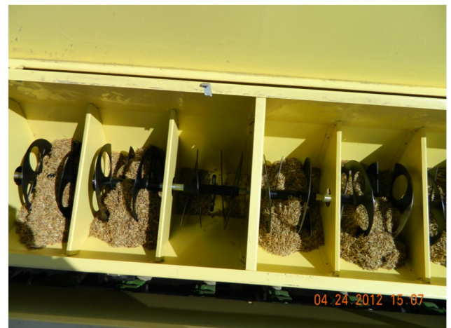
Fig. 2. Seed box with an agitator.

ahead of the seed. The second presses the seed into the soil. These seeders do a great job of ensuring shallow seed placement, leaving some seed visible on the soil surface or in the shallow furrows created by the cultipackers, particularly when the seedbed is relatively smooth and firm prior to seeding. This type of seeder is most effective when vegetation residue on the soil surface is light enough to allow most seed to contact the soil when dropped.