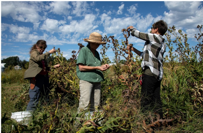
Collecting silphium.

Nebraska’s tall-grass prairies are considered critically imperiled by Nebraska’s Natural Heritage Program. Most of these prairies exist as remnant patches, scattered across the eastern edge of the State. These imperiled ecosystems hold the key to their own survival. Tiny bits of prairie make a big impact when the seed collected there can be increased and sown again in other prairie restorations or recreations. In order to recreate, replant, and revive these prairies with genetically appropriate and diverse material, Prairie Legacy collects seed from as many as 200 species of plants each year from these remnant prairies.