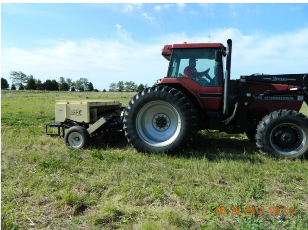
Fig. 1. Drill with multiple seed boxes.

Grassland Drills. Drills designed to handle a variety of different seed types and ground conditions are one of the most practical choices for seeding. Many of these drills utilize multiple seed boxes that meter and direct seed between or behind double disc furrow openers (Fig. 1). These drills have three important features for seeding perennial grasslands; 1) different agitation and “picker” types to effectively meter fluffy seed (Fig. 2), 2) adjustments that ensure shallow seed placement, and 3) no-till coulters to cut through or move existing vegetation. These features combine to make these drills versatile tools for establishing or renovating perennial grasslands.