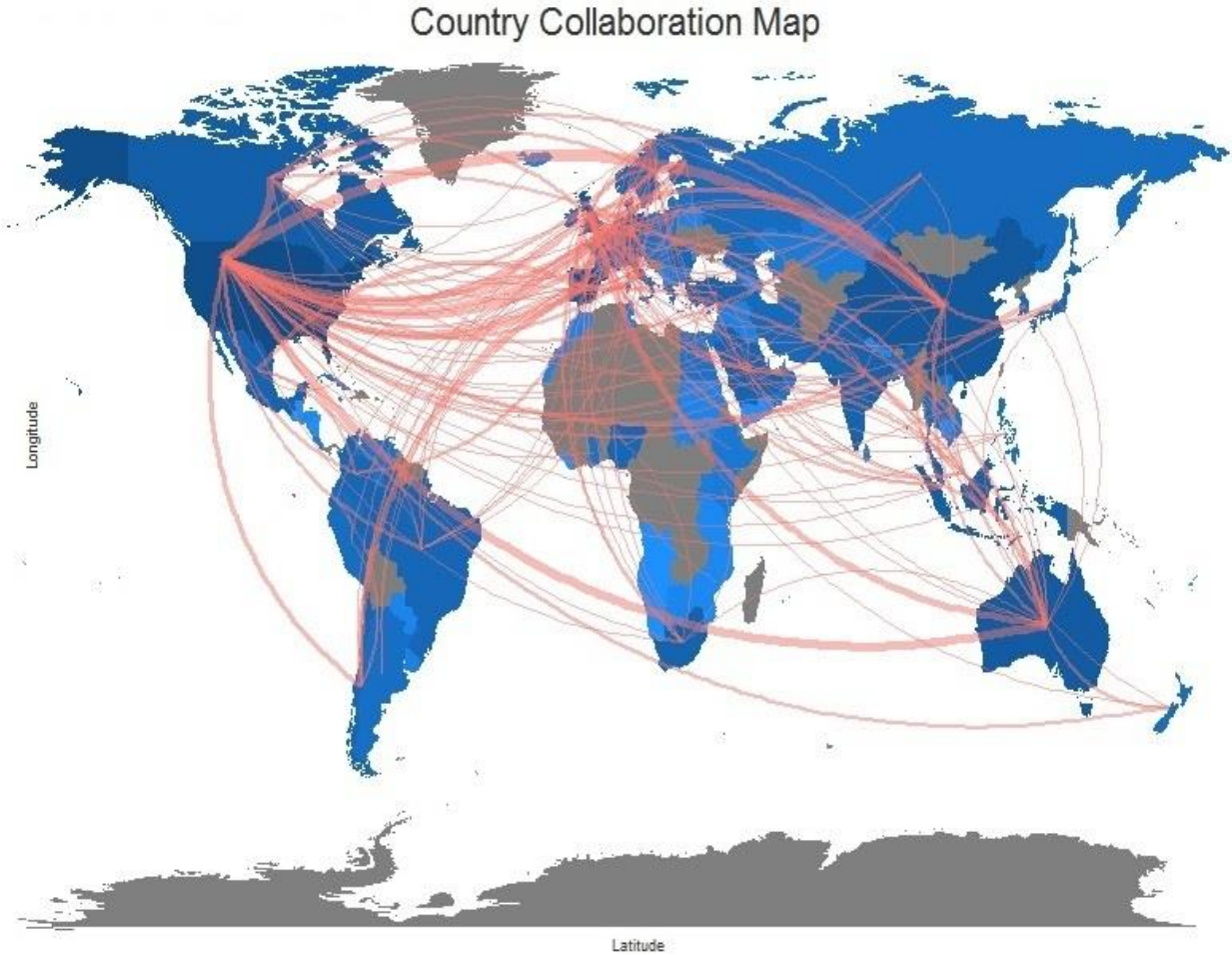
Figure 2. Top Country Collaborations for Published Documents from 2001 to 2020