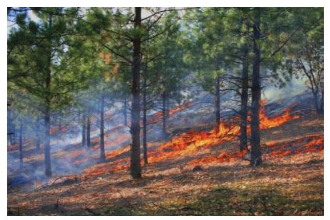
Prescribed burn treatments were ignited using spot and strip firing methods.

Using a vertical shaft mastication head mounted to an excavator boom, mastication was completed between the fall of 2005 and the summer of 2006. The prescription included leaving trees over 38-centimeter diameter at breast height and thinning to a density of approximately 25 trees per acre. Prescribed burning was completed on December 5–6, 2007. Air temperature during the burn ranged from 41 to 60 degrees Fahrenheit and relative humidity ranged from 30 to 100 percent, with precipitation beginning during the burning of the last unit. Litter moistures ranged from 8 to 12 percent, and the Keetch Byram Drought Index (KBDI) was 476. Other than two days of trace precipitation, 0.1 inches of rain fell 24 days prior to the burn. Precipitation began while the last unit was burned. Wind speed during the burn ranged from 3 to 8 miles per hour with gusts to 13 miles per hour. Ignition patterns of the prescribed burns included both spot and strip firing. Spot firing is the ignition of separate, small dots and strip firing is the ignition of lines. The units were ignited starting from the uphill side of the unit and working downhill, unless wind direction dictated otherwise.