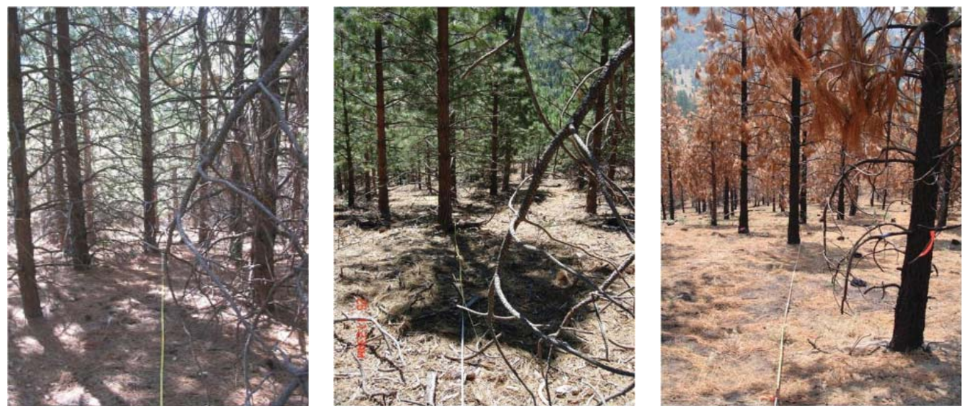
From left to right, the following treatment stages are shown: pre-mastication, post-mastication, and post-burn. Preliminary study results indicated that mastication increases surface fuel and prescribed fire reduces masticated fuels, but not necessarily to pre-burn levels.

Researchers used FMAPlus to predict post-wildfire mortality for post-treatment fuels during 97<sup>th</sup> percentile weather conditions, resulting in 28 percent mortality for masticate/burn treatments, 30 percent for masticate/pullback/burn treatments, 57 percent for the untreated control, and 87 percent for mastication-only treatments. Indicating that wildfire mortality rates were highest for masticationonly treatments, with the untreated control having the next highest predicted mortality.