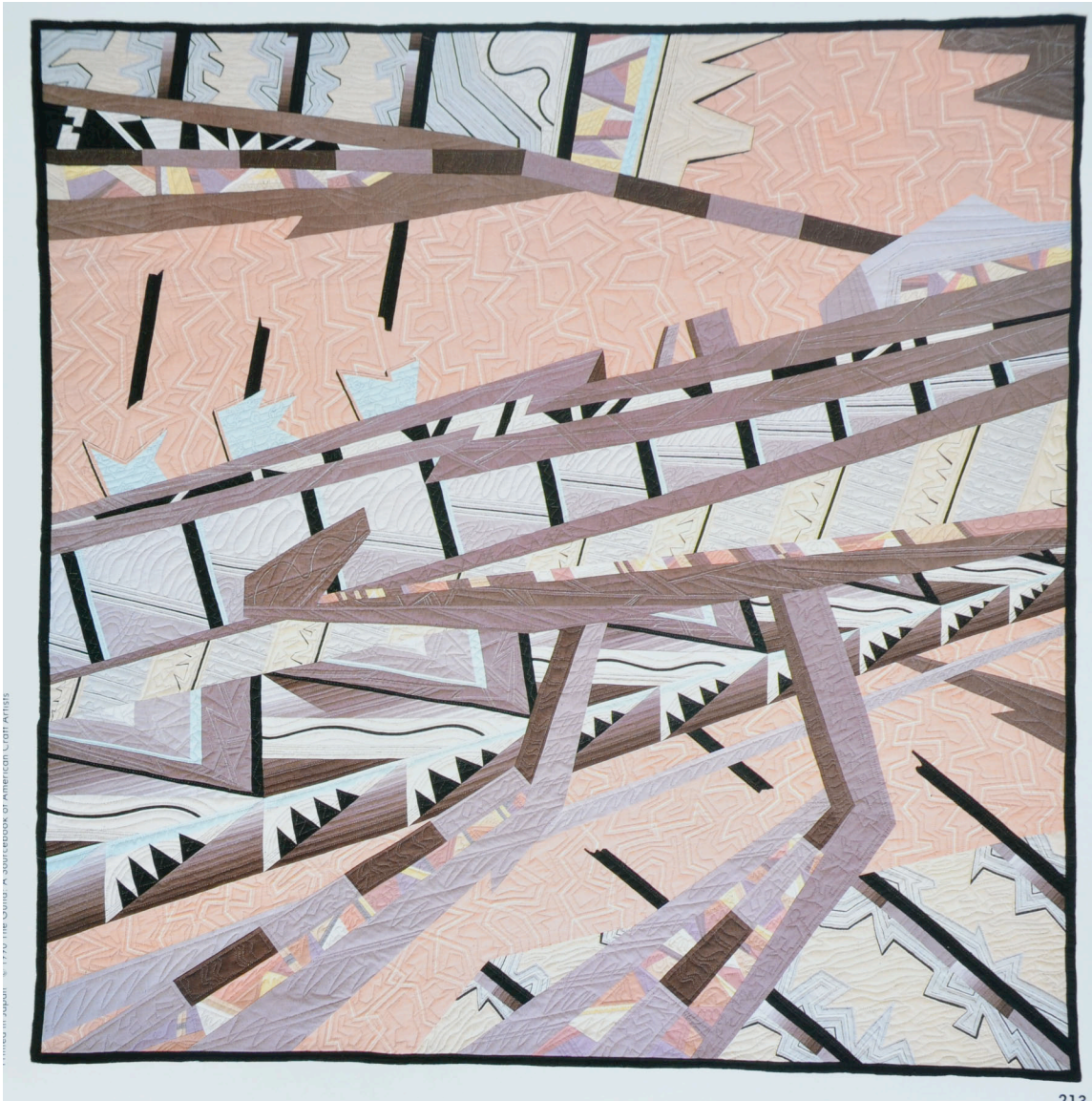
Figure 12 Linda MacDonald Salmon Ladders 1986 92" x 92" painted and hand dyed cotton; machine pieced; hand quilted