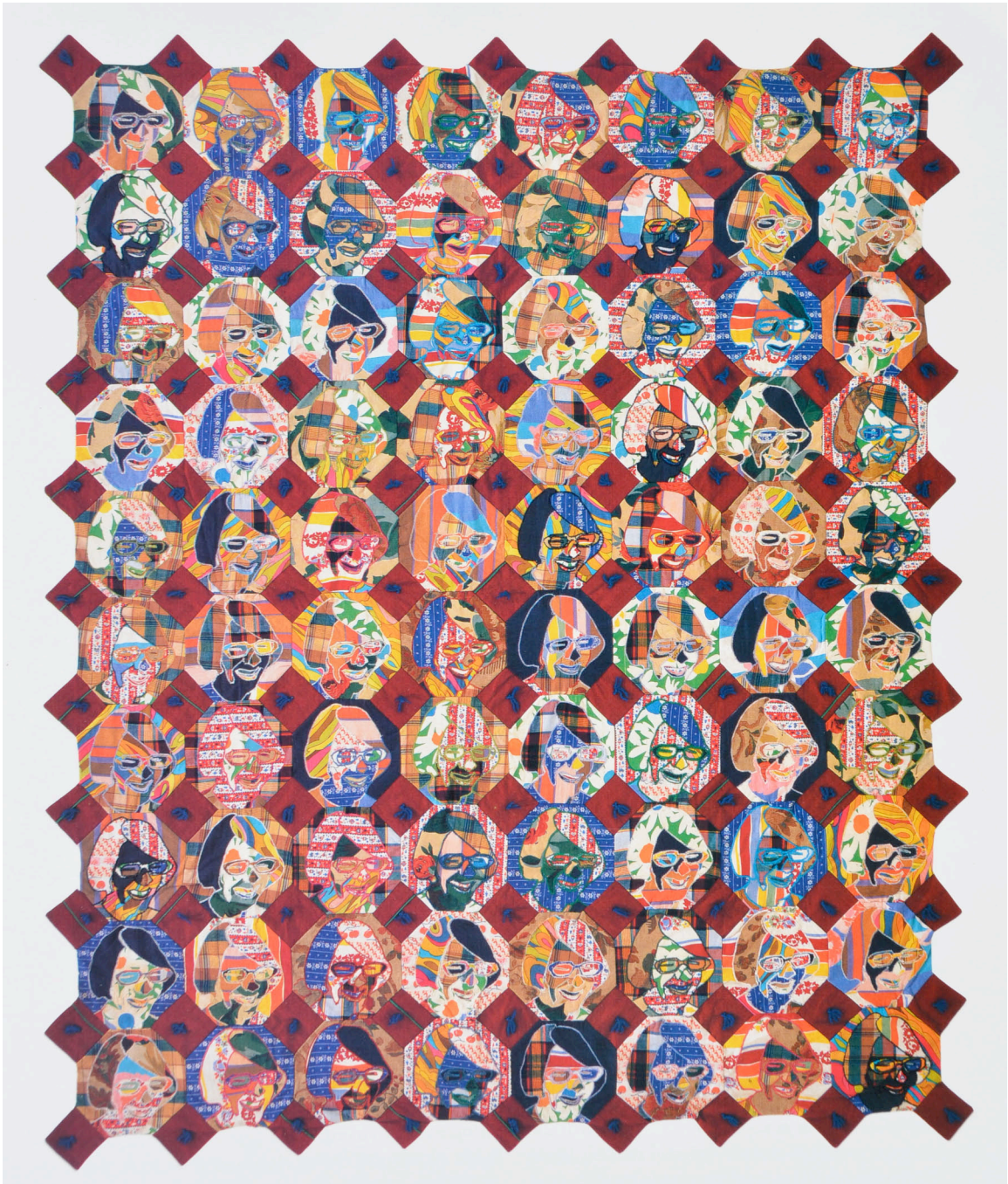
Figure 10 Therese May Therese 1969 90" x 72" cotton on muslin backing; machine appliquéd, tied