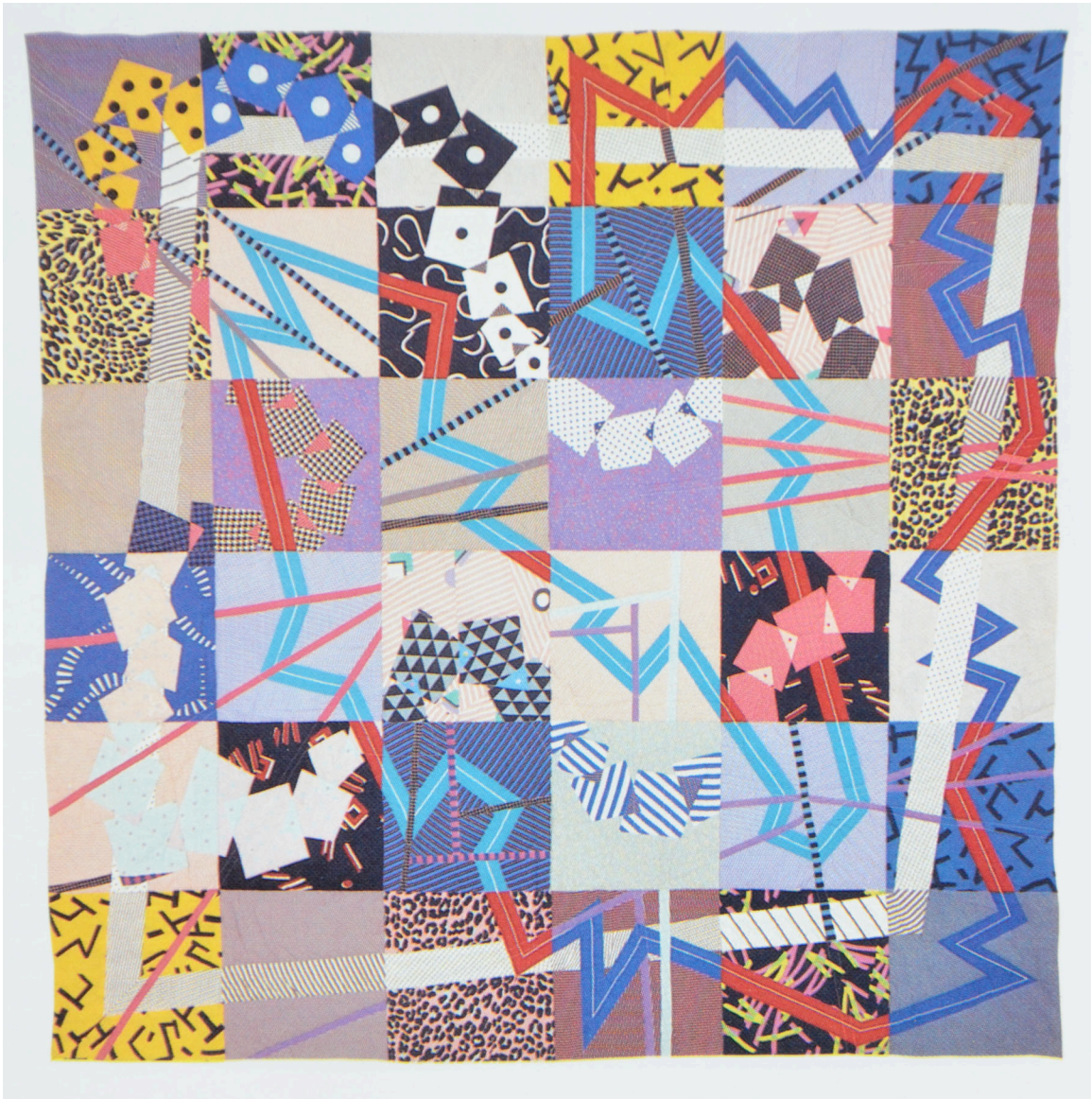
Figure 14 Ellen Oppenheimer Broken Arm Quilt 1986 72" x 72" Machine pieced and appliquéd