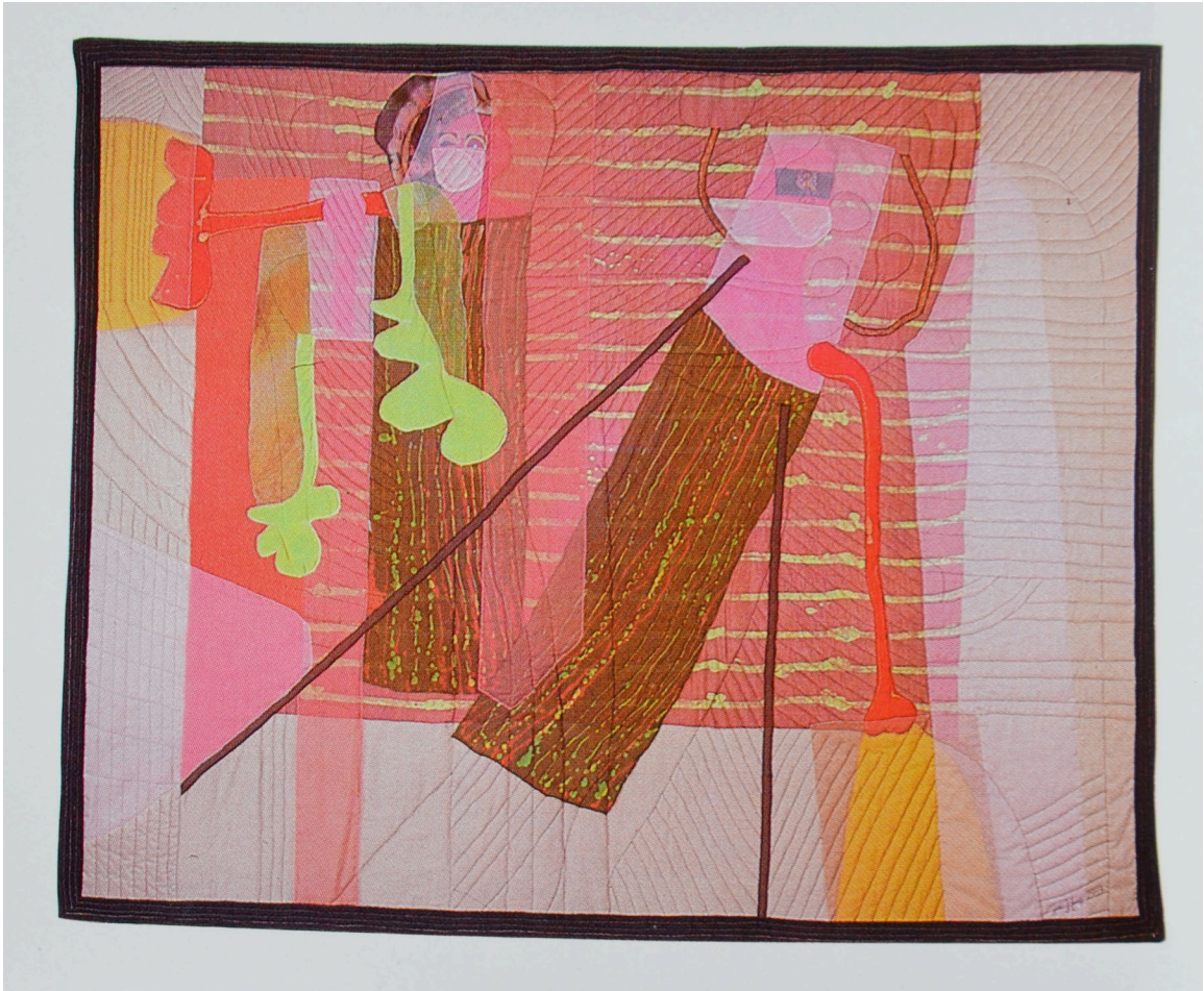
Figure 7 Jean Hewes Rocketing 1984 92" x72" silk, cotton, rayon; machine pieced and appliquéd