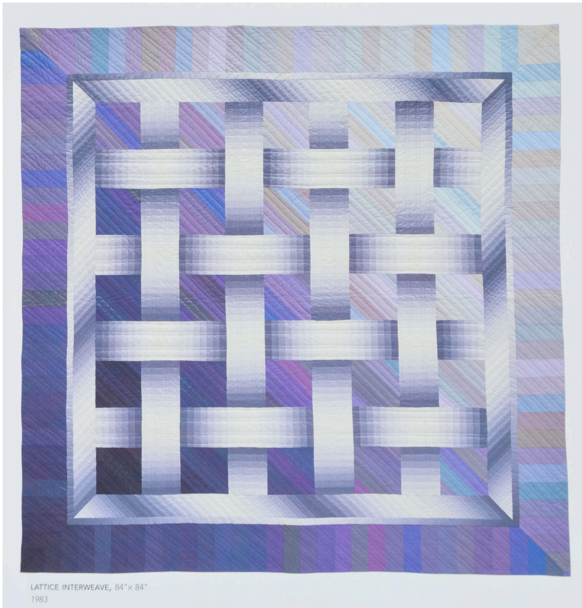
LATTICE INTERWEAVE, 84" x 84" 1983