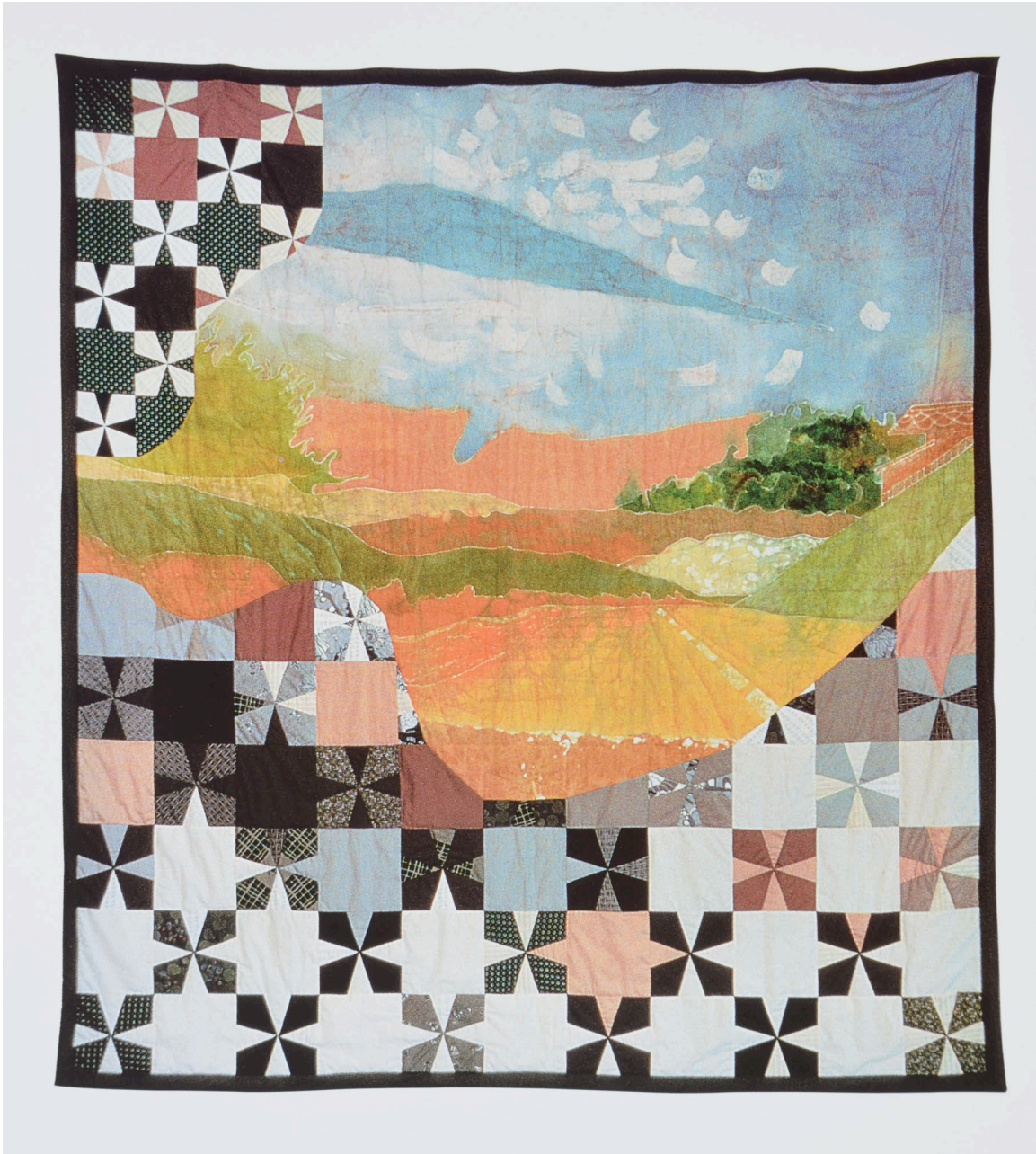
Figure 4 Joan Schulze California 1976 104" x 96" cotton, batik on cotton; hand pieced , appliquéd and quilted