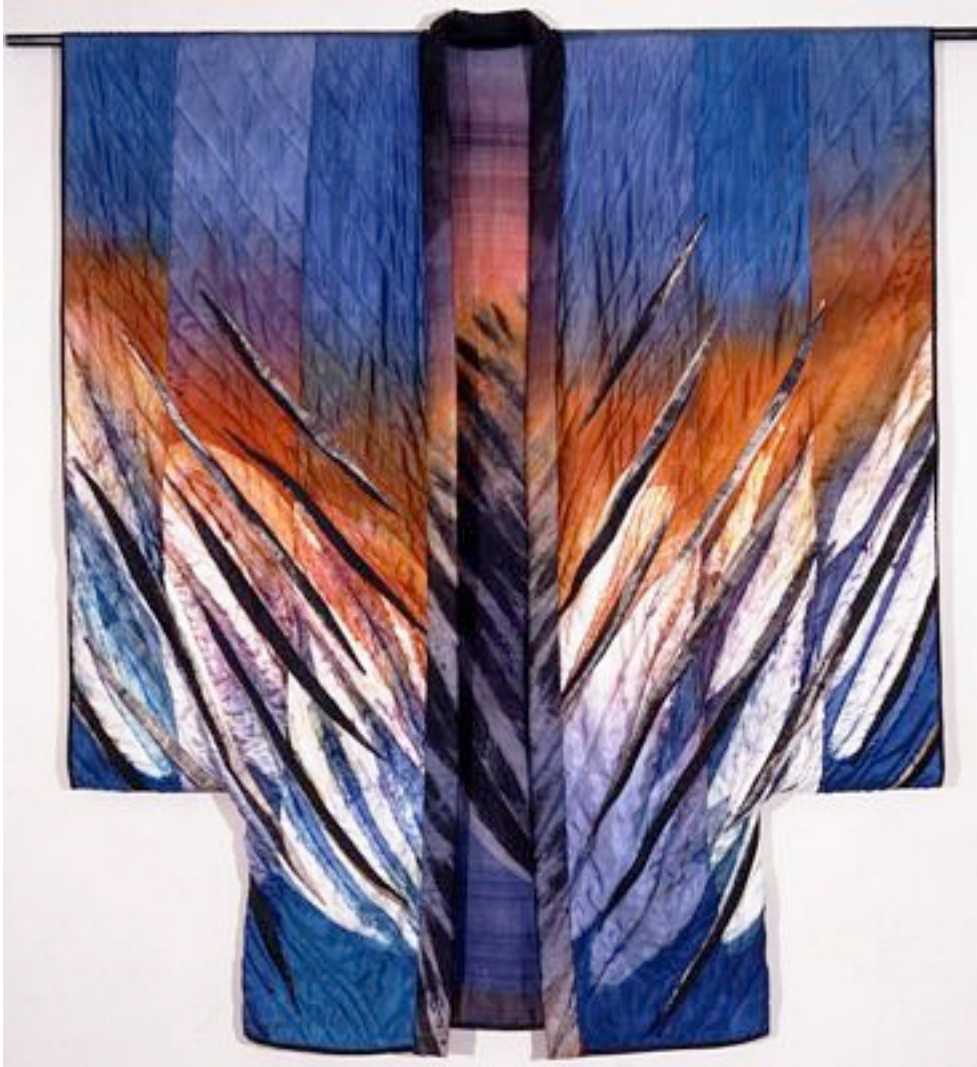
Figure 16 Judith Content Sweltering Sky Front 1986, back 1992 61" x 52" shibori discharged and dyed silk Collection of Fine Arts Museums of San Francisco