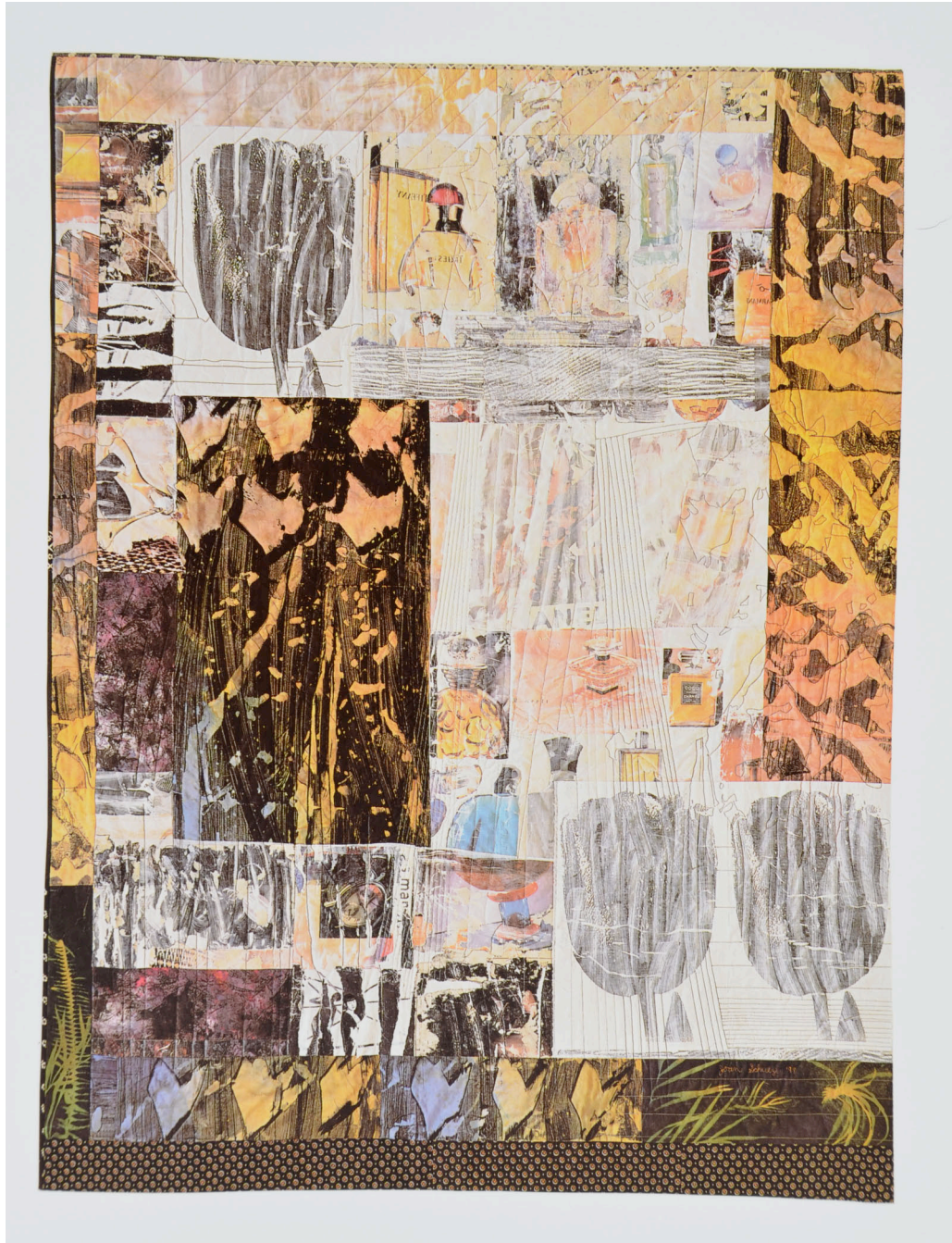
Figure 5 Joan Schulze Aroma 1997 70" x 53" silk, cotton, paper; monoprinted, blueprint process, machine pieced and quilted