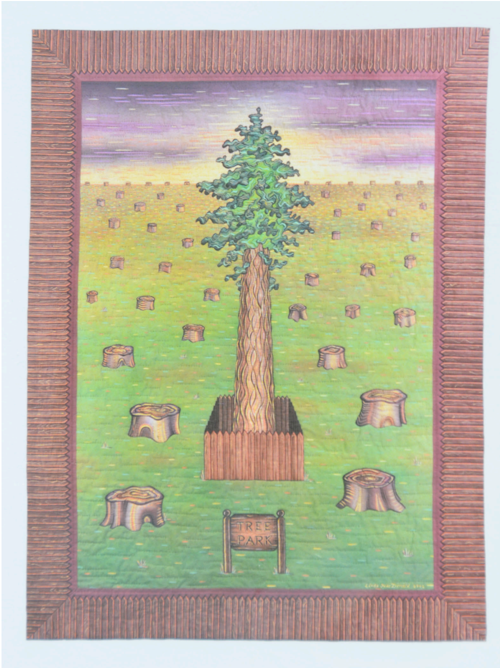
Figure 13 Linda MacDonald Tree Park 2002 36 x 48 hand painted and hand quilted