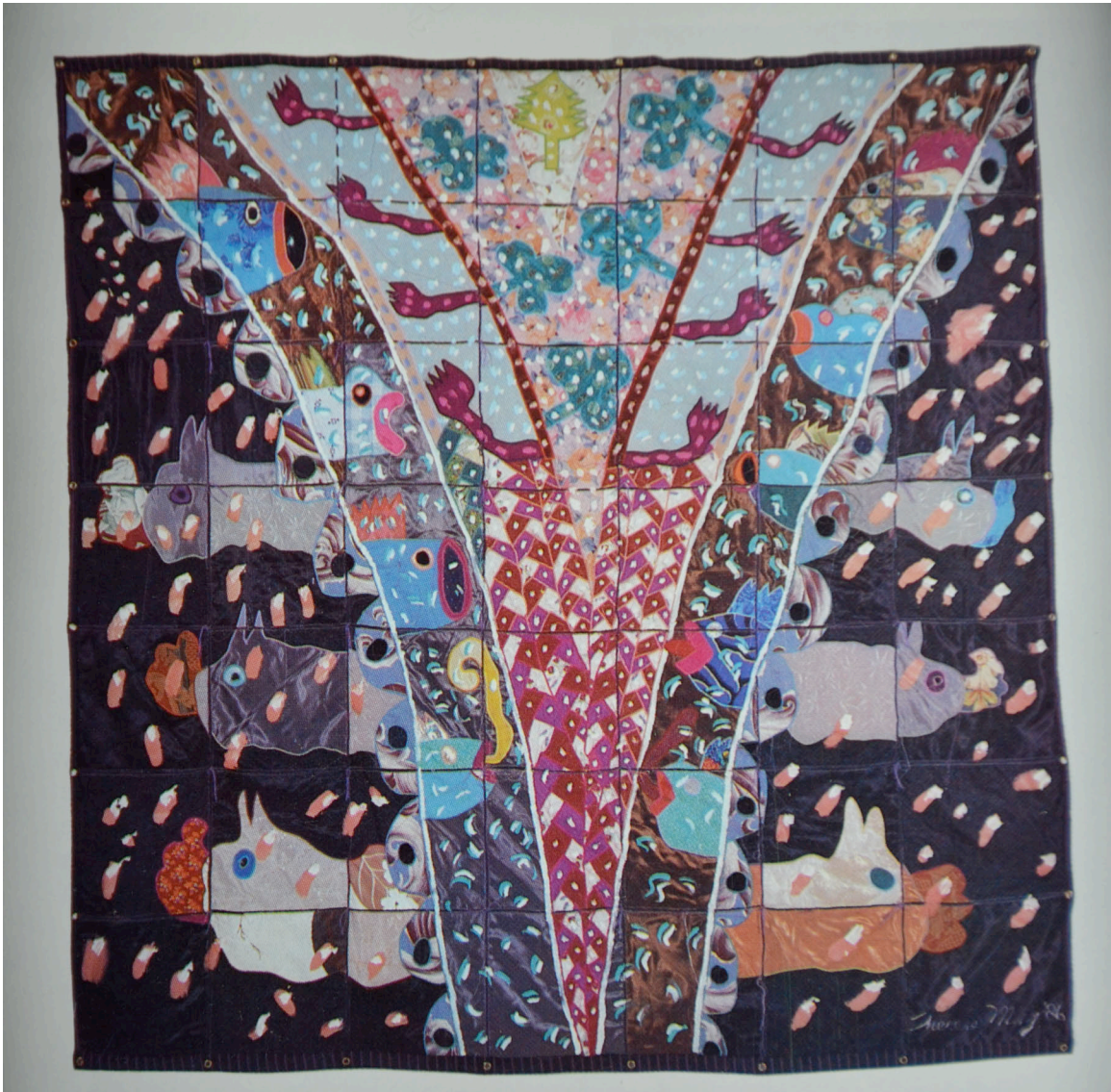
Figure 11 Therese May Fish and Chicks 1986 83" x 85" polyester, cotton, silk, taffeta, acrylic paint; machine appliqué