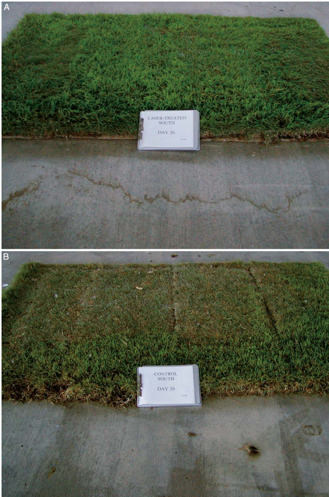
Figure 3. Grass sod from a laser-hazed (A) and control (B) subplot subsequent to the 20-day habituation test of a laser hazing system for repelling Canada geese.