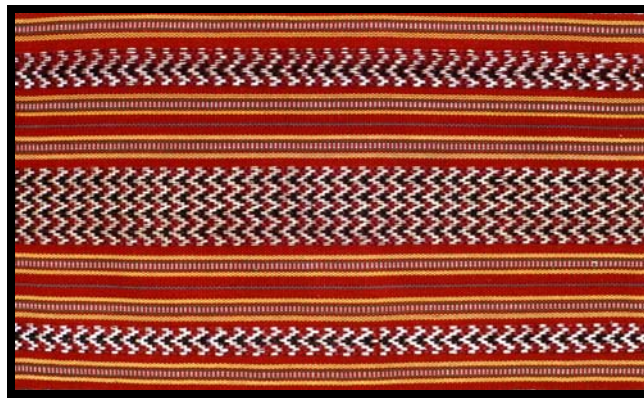
Figure 1. Detail of a strip of cloth featuring the tu muk motif. Woven in 2007. [MH]

Decorative sashes and other narrow strips of cloth are woven on a long and narrow type of frame loom that will be described in detail below. This loom appears to be designed to weave a variety of supplementary warp and supplementary weft motifs on relatively narrow bands of cloth. These bands can be used for decorative sashes, added to the edges or wider pieces of cloth for decoration, or stitched together to form wider pieces of cloth that are covered with decorations. In addition to a range of geometric patterns, there are also more realistic motifs. Complex motifs depicting Siva on top of a peacock and another of a dragon (see Howard 2005: 129, fig. 14) are woven only using the supplementary weft technique. A somewhat less graceful motif depicting a human figure is woven using the supplementary warp technique. Geometric figures are woven using both the supplementary weft and the supplementary warp motif. The gal vak is an especially popular geometric motif woven using