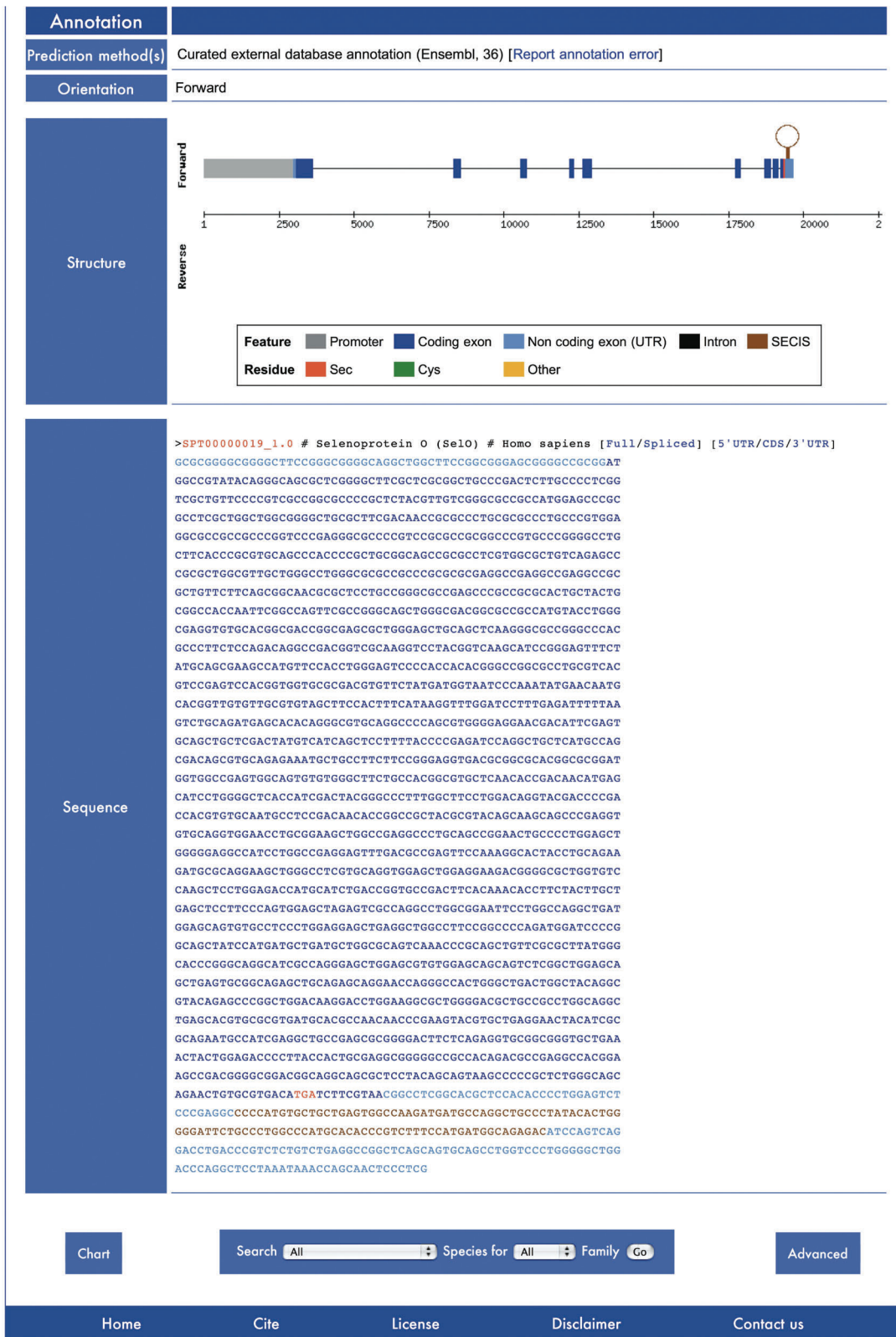
Figure 3. Transcript Report of human SelO. Note the color coded gene structure and the spliced transcript sequence with sequences features colored accordingly. Other sequence views are one click away at links at the end of the sequence ID line.