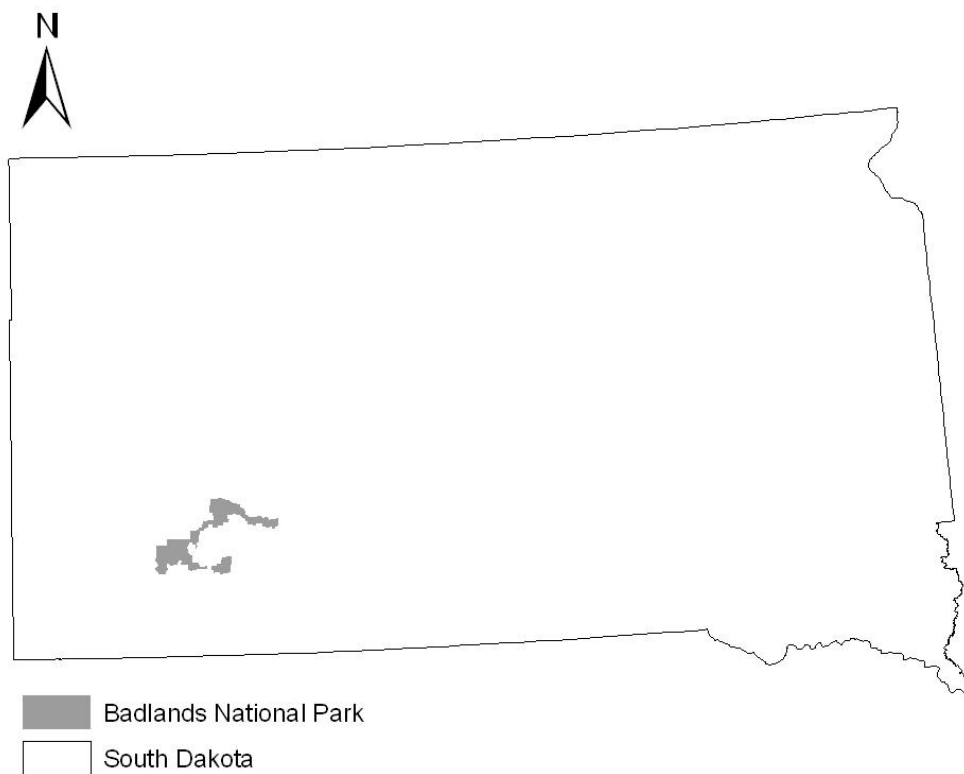
Figure 1. Swift fox study area in Badlands National Park located in southwestern South Dakota, USA, May–July 2009.

C and 47° C. Topography of the region was diverse and elevation ranged from 691 to 989 m above mean sea level (Russell 2006). The area within BNP was typified by highly eroded cliffs and spires over 100 m in height. Outside BNP, the terrain was less rugged and typified by rolling prairies and a relatively flat area (e.g., Conata Basin; Russel 2006). Vegetation in the region was dominated by mixed grass prairie species including buffalograss ( Buchloe dactyloides ), western wheatgrass ( Pascopyrum smithii ), and prickly-pear cactus ( Opuntia polyacantha ); the region was mostly void of tree and brush species (Russell 2006). The Cheyenne and White rivers formed the western and southern boundaries of the study area, respectively.