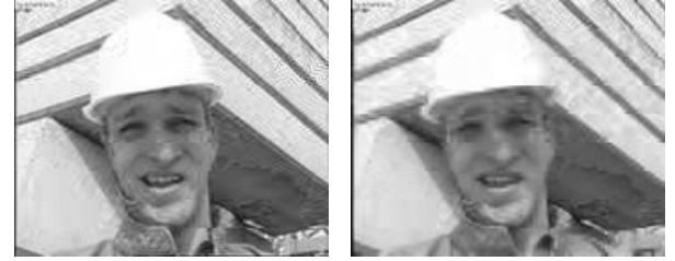
(d) 44th frame coded at W=100\text{kHz} , \bar{\gamma}=10\text{dB}