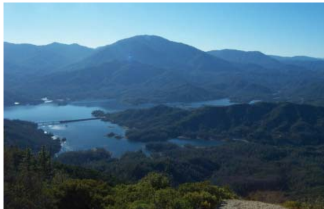
Whiskeytown is not only beautiful, but biologically diverse.

shrub community dominated by white leaf manzanita ( Arctostaphylos viscida ) and intermixed with toyon ( Heteromeles arbutifolia ), poison oak ( Toxicodendron diversilobum ), buckbrush ( Ceanothus cuneatus ), and chamise ( Adenostoma fasciculatum ).