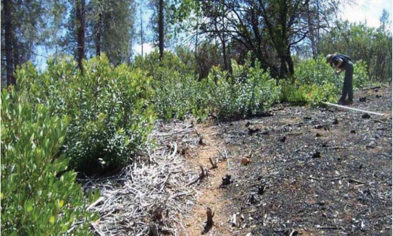
This study plot at Whiskeytown National Recreation Area was mechanically masticated and burned.