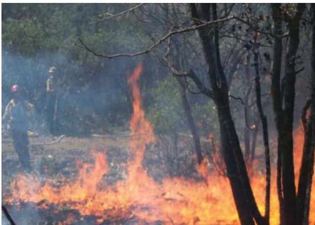
The dense, fire-prone vegetation at Whiskeytown must be carefully managed.

While cost-effective and efficient, land managers know little about the potential effects of these treatments on the soil and soil organisms. Thus, researchers used this study to investigate the treatment effects on mycorrhizal and hypogeous fungi in the mixed oak shrubland of Whiskeytown.