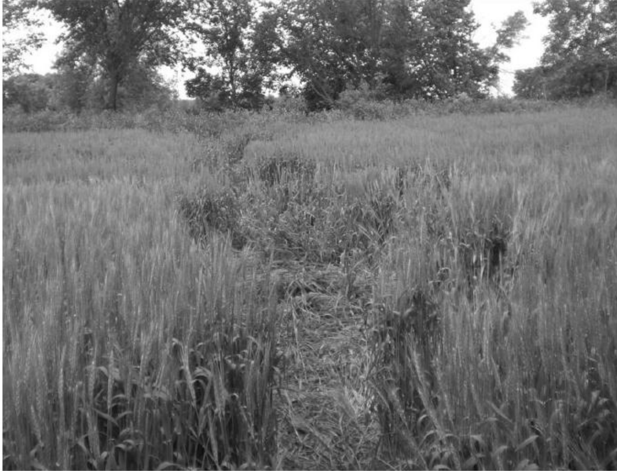
Figure 3. Crossover trail created by river otters through a wheat field along the Turtle River in eastern North Dakota, 28 June 2008.