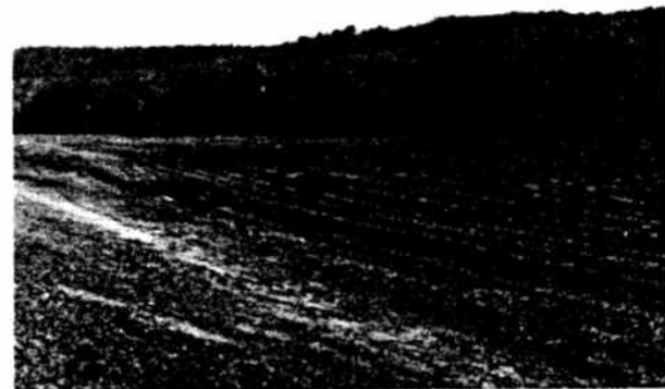
Figure 3. The Rock Creek Site, Natchez Trace Parkway, Alabama: Buried site approximately two years later showing damage from farm equipment.

stratigraphic layer is anticipated, benchmark placement should be done in such a manner as to accommodate the new use.