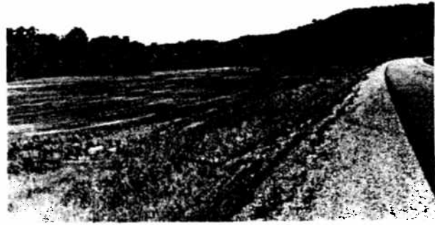
Figure 2. The Rock Creek Site, Natchez Trace Parkway, Alabama: Site returned to cultivation.

Several other concerns must be taken into account before proceeding with the actual burial of an archeological resource. First among these is the establishment of a reference or benchmark system so that the site and specific loci within it can be relocated in the future. This is particularly important if future scientific investigation is specified as a goal for the burial project. Permanent markers should be set and appropriate maps should be marked to indicate the location of the site. Pertinent benchmark data should be noted on the maps as well as contained in a written report. Clear and easily located on-the-ground marking is particularly important if the site is likely to be in a construction impact zone in the future. If post-burial use of the newly created