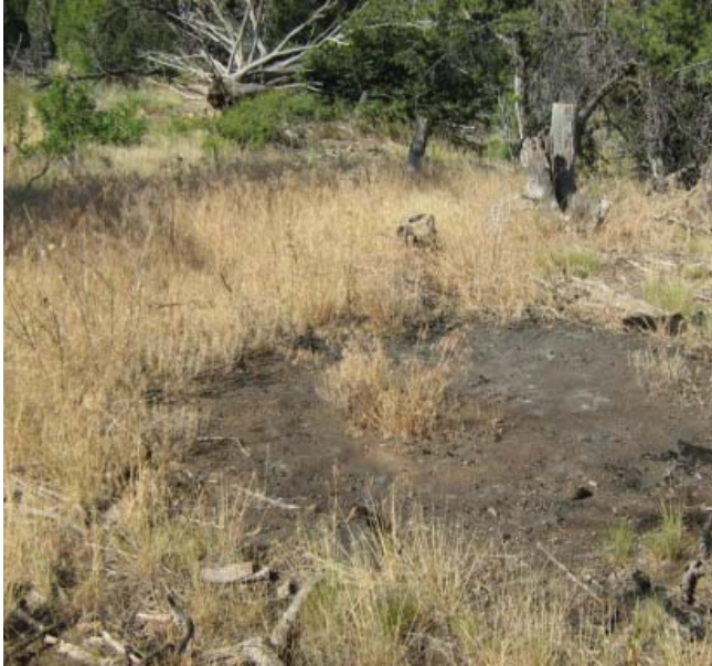
At the Summit research plots in the third year post-treatment, cheatgrass flourishes after a pile burn.

ratios of the surface organic matter and decomposition of masticated materials, as well as conducting an in-situ decomposition analysis of organic masticated residues of varying sizes.