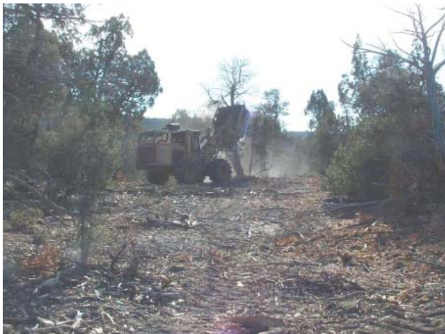
A hydro mower leaves behind a sea of woody debris at the School site near Egnar, Colorado.

General mastication guidelines called for the creation of a random mosaic of small openings and strips. Density of trees 1–10 inches diameter at breast height was to be reduced. Eighty percent of the treated woody material should be less than one inch in diameter, 6 inches long, and 6 inches deep on top of the soil surface. Live pinyon trees and designated snags were to be protected and 50 percent of the brush canopy was to be retained.