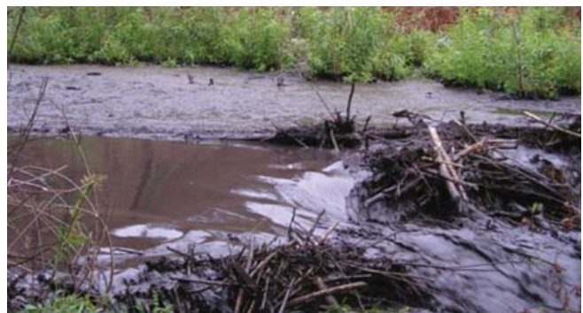
(Top) White Creek Mesa 2003 Dry Lake Fire Use Fire where it burned hot in the White Creek drainage, resulting in ash and debris flow. (Bottom) Ash and debris flow, Gila trout stream post-2003 Dry Lakes Fire Use Fire.