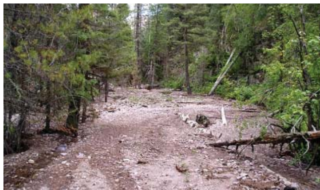
Mass soil movement, Upper West Fork Gila River following the 2002 Cub Fire. High flows since have moved a lot of the material downstream.

The researchers also used geographic information system technology to map the 21 patches where Gila trout occurred and those scheduled for restocking. Comparing those maps with the remote sensing data on burn severity helps determine those streams where severe burns may result in post-fire effects such as ash and debris flow, which can destroy downstream habitat.