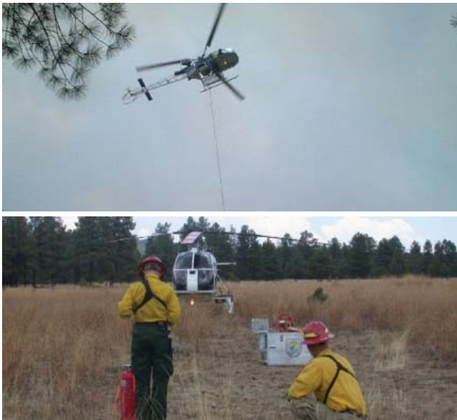
(Top) Helicopter with tank used to evacuate fish. (Right) Helicopter retrieving fish hauling tank once loaded with fish. Fish are transported to Mora National Fish Hatchery via the hatchery truck.

Translocating fish during a fire, however, is risky for personnel as well as fish. People ride in on horseback, shock and gather fish, and transport them to helicopters for removal to a safe location. “In some of these places it takes a day to ride in,” says Monzingo. “Evacuation is stressful when the fire is right there.”