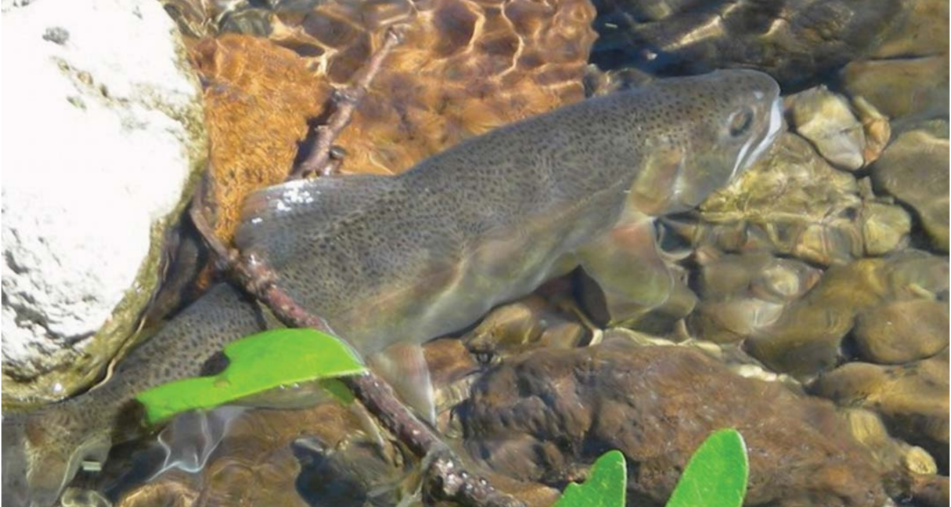
Gila trout.