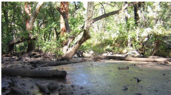
(Top) Interagency crew collecting Gila trout to evacuate. Mogollon Creek, 2003 Dry Lakes Fire Use Fire. After a 5-hour horseback ride into stream. (Bottom) Ash and debris flow in Turkey Creek (Gila chub stream) following the 2003 Dry Lakes Fire Use Fire.