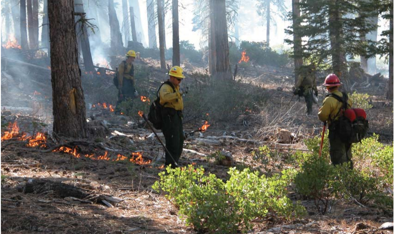
Crews igniting a prescribed burn in California.