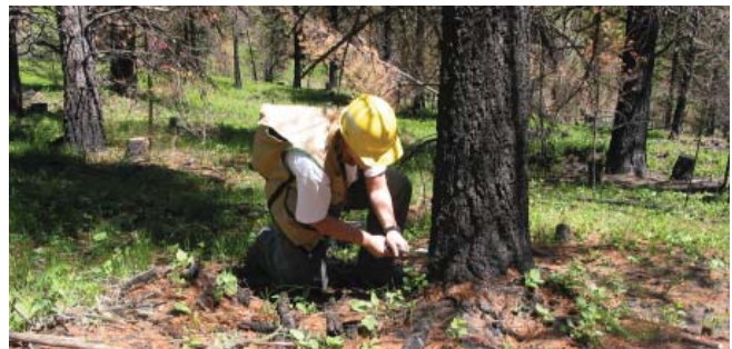
Checking for cambium injury after fire.