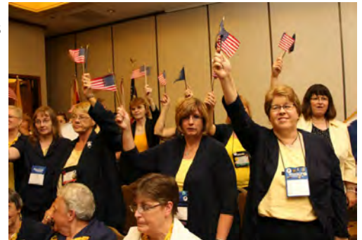
Members stand during flag ceremony