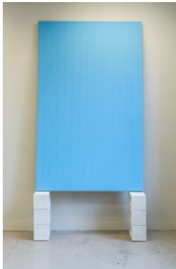
Untitled (Wall Siding), 2017

Spray paint, primer, joint compound, insulation foam, wood; Latex paint on canvas