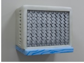
Back Side/ Same Location, 2017

Spray paint, oil paint, primer, joint compound, insulation foam on wooden structure