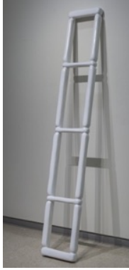
Other Ways , 2016

Spray paint, primer, joint compound, and insulation foam on wood structure 96 X 15 X 3.5 inches