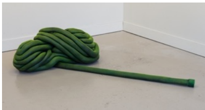
Tangled (Water Hose) , 2017

Plasti-Dip, primer, joint compound, insulation foam 71 X 31 X 17 inches