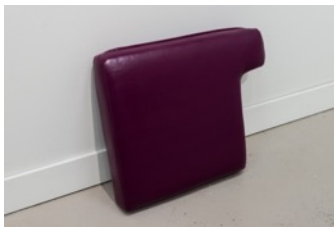
Cargo Seat (Couch Cushion) , 2017

Spray paint, primer, joint compound on found couch cushion 32 X 27 X 5 inches