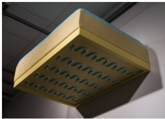
No Wiggle Room, Again , 2017

Spray paint, primer, joint compound, foam mattress, on wooden structure 13.5 X 48 X 32 inches