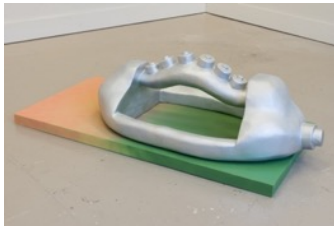
Out of Reach, 2017

Spray paint, primer, joint compound, insulation foam, wood panel