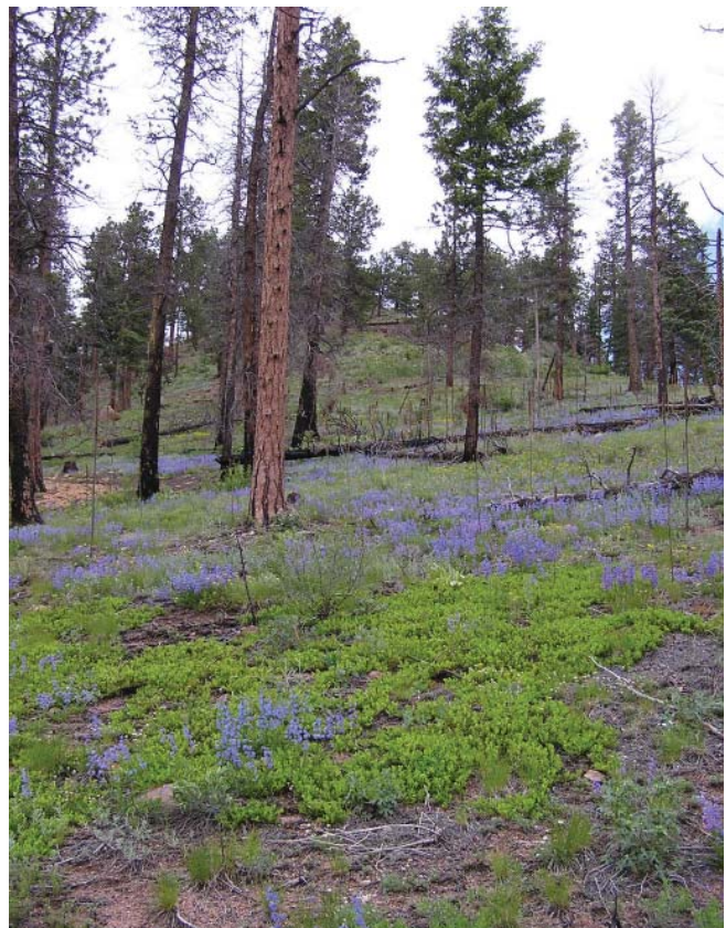
Fire resistant Penstemon virens returning on Colorado's Front Range after the 2002 Hayman Fire.

through a series of steps to estimate the risks and benefits from wildland fire across landscapes. Significantly, FEPF steps allow for multiple types, scales and sources of data and computer programming knowledge. This is useful for designing fire and fuels management plans and identifying areas of highest priority for fuels treatment. FEPF can also be used during active wildfire incident planning to determine whether fire is likely to produce resource benefits or detriments in given areas. "FEPF's process is straight-forward," Black says. "It's A plus B equals C. It's based on information that people have at their fingertips." So why wasn't it more widely used?